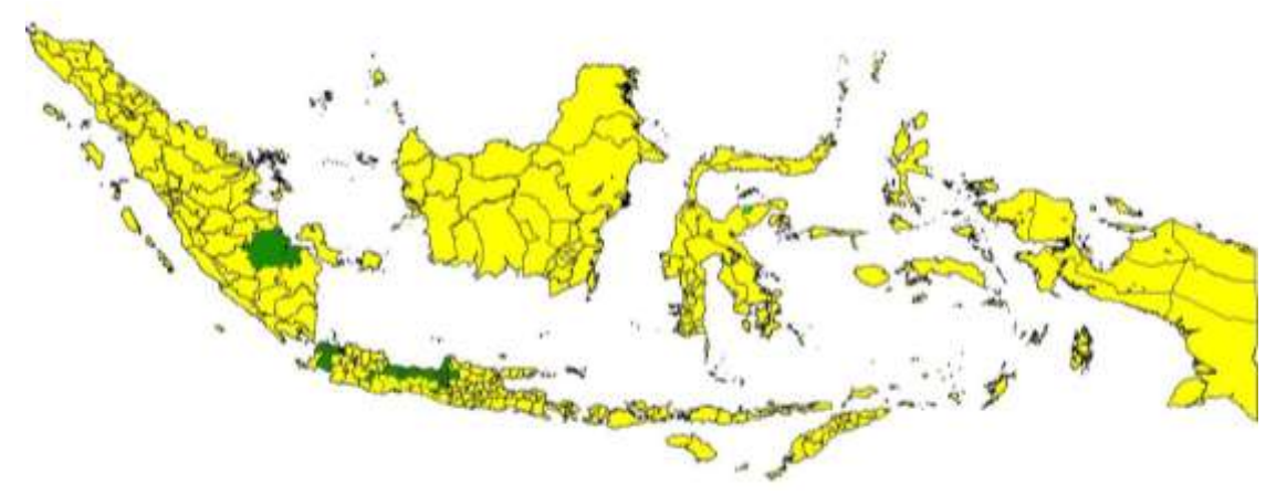
Figure 1. Distribution range of M. subtrijuga in Indonesia (shown in green) (CITES MA and SA of Indonesia in litt. to UNEP-WCMC, 2017).

In Java , three locations were mapped by Iverson (1992). The species was reported to occur in Banten (Banten Province), Cirebon, and Tasikmalaya (Jawa Barat Province), Jakarta (Jakarta Raya Province) [all West Java], Depok [Central Java], and Surabaya (Jawa Timur [East] Province) (Brophy, 2005). The CITES MA and SA of Indonesia confirmed records of occurrence in western Java (Banten, Jakarta, Serang, and Tasikmalaya) (based on records from the Museum Zoologicum Bogoriense (MZB)) and in Central Java (Mumpuni & Riyanto, pers. obs. to CITES MA and SA of Indonesia in litt . to UNEP-WCMC, 2017). A range map for the species is provided in Figure 1.