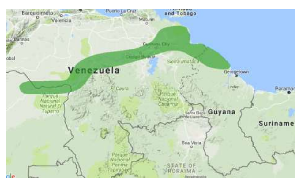
Figure 1. The distribution of A. festiva [ A. bodini ] according to BirdLife International, 2017.

Distribution: A. festiva occurs in Brazil, Bolivia, Colombia, Ecuador, Guyana, Peru and Venezuela (Lopes et al. , 2015). Juniper and Parr (1998) noted that A. f. bodini occupied north-west Guyana and Venezuela in the southern Apure on the Rio Meta and middle Orinoco to Delta Amacuro, and A. f. festiva occurred in eastern Colombia, Peru and Brazil.