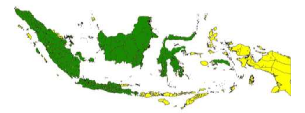
Figure 1. Distribution range of O. hannah in Indonesia (shown in green) (CITES MA and SA of Indonesia in litt. to UNEP-WCMC, 2017).

In Sumatra , the species appears to be widespread, and was reported from Aceh Province, Bengkulu Province, Jambi Province, Riau Province, Sumatera Barat (West) Province, Sumatera Selatan (South) Province and Sumatera Utara (North) Province (Teynié et al. , 2010), and from Kerinci Seblat National Park in West Sumatra (Kurniati, 2009). The species was reported to occur in East, Central and West Java by Hodges (1993) and has been reported from the Rajegwesi tourism area in Meru Betiri National Park, East Java (Raharjo and Hakim, 2015). Java was noted to have large areas of paddy fields that attract prey species of O. hannah (CITES MA and SA of Indonesia, in litt. to UNEP-WCMC, 2017). In Bali , the species was reported to be definitively known only from Negara in the island's west and from Bali Barat (West Bali) National Park (Stuart et al. , 2012), however Natusch (pers. comm. to UNEP-WCMC, 2017) reported that it was widespread on the island.