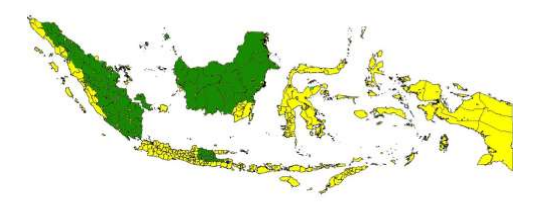
Figure 1. Distribution range of N. platynota in Indonesia (shown in green) based on available museum records and literature (CITES MA and SA of Indonesia in litt. to UNEP-WCMC, 2017).

Population status and trends: N. platynota was categorised as Vulnerable in the IUCN Red List on the basis of trends in range States and noting high global trade levels (Asian Turtle Trade Working Group, 2000). In Indonesia, the population had declined from "extremely common" in the late 1980s to "reasonably common" in 2000; in Malaysia, the species habitat was reported to have decreased while trade volumes had increased; and in Thailand, the species was considered at least Vulnerable (Asian Turtle Trade Working Group, 2000). It was noted that the species was traded at levels of two to three tons per day in East Asian food markets in 1999 (B. Chan and R. Kan, pers. comms. in Asian Turtle Trade Working Group, 2000). The IUCN assessment for this species was considered in need of updating (Asian Turtle Trade Working Group, 2000). The IUCN assessment for this species was provisionally reclassified as Vulnerable in a draft reassessment by the IUCN/SSC Tortoise and Freshwater Turtle Specialist Group (TFTSG) in 2011 (van Dijk et al. , 2012, 2014).