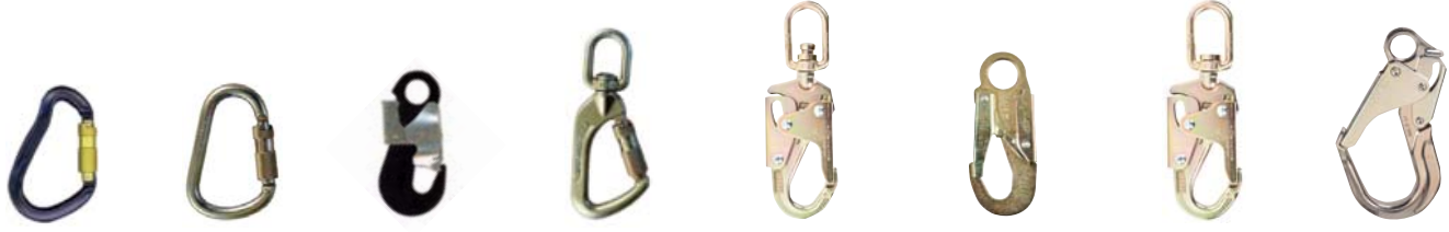
1" Aluminum Carabiner