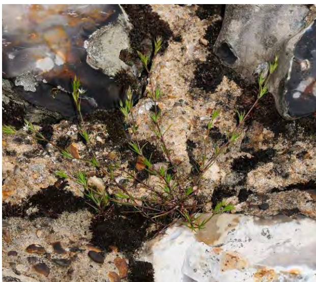
Minuartia hybrida at Eynsford Castle, west Kent.

The lower leaves are crowded near to the base of stems, often giving the plant a 'knotted' appearance. The erect, slender