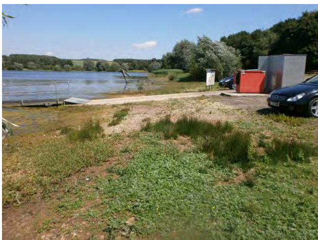
A population of Juncus compressus on the edge of Pitsford Reservoir, Northamptonshire.

In North America, where the species is considered an introduction, inland populations occur on motorway verges amongst other halophytes, along railways and canal banks, and on disturbed roadside ditches (Brooks & Clements 2000).