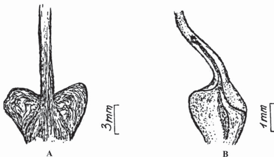
Fig. 1. Stipule-like bases of basal leaf petioles from species of Anemone section Anemone : A. A. coronaria ; B. A. hortensis .

The essential characters of subgen. Anemone and sect. Anemone given by TUTIN (1964) and CHATER (1993) are densely lanate fruits (achenes) with hairs longer than their diameter and by TAMURA (1991) – sessile fruits densely covered with long woolly hairs, subsessile involucre leaves, 5-20 tepals and tuberous rhizomes. As a result of the field study of A. coronaria and A. hortensis which was done by Ziman & Medail in early spring of 1997 in South Western Europe (France, Maritime Alps), they noted in both species stipule-like appendages at the base of basal leaf petioles (Fig. 1) and stolon-like ephemeric rhizomes (present during about three weeks in the early spring)