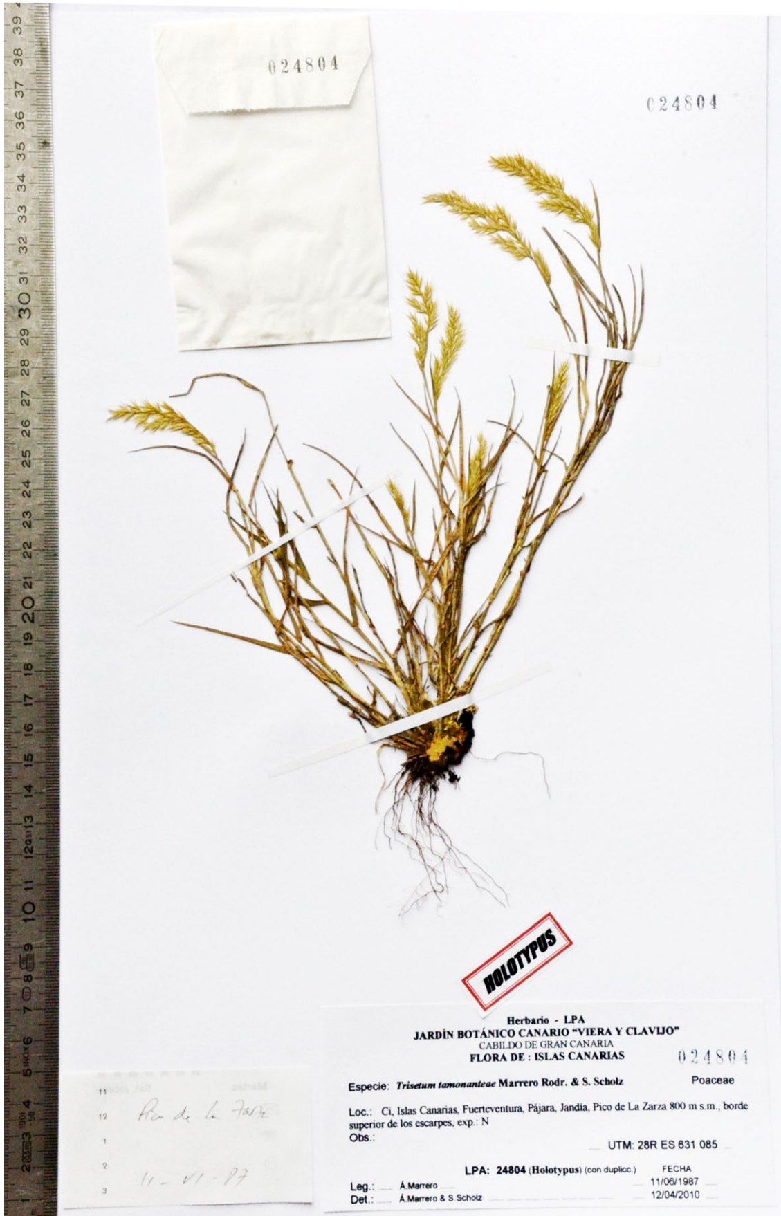
Fig. 1. Holotype of Trisetum tamonanteae – A. Marrero (LPA 24804).