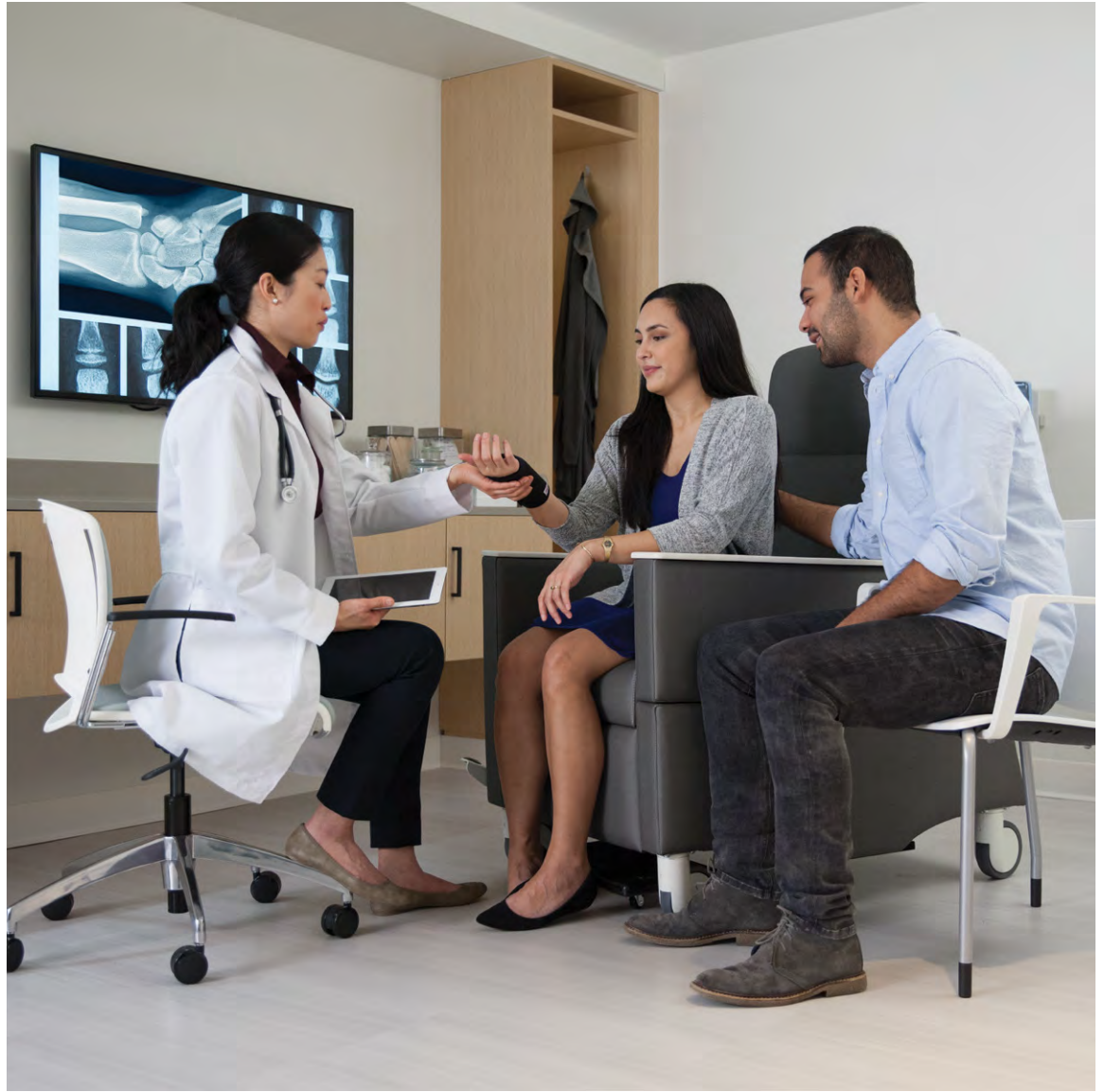
Above: Mile Marker modular cabinetry, Modern Amenity lite patient recliner, Lado guest, Quickstacker task Left: Stray mobile table, Lasata patient recliner