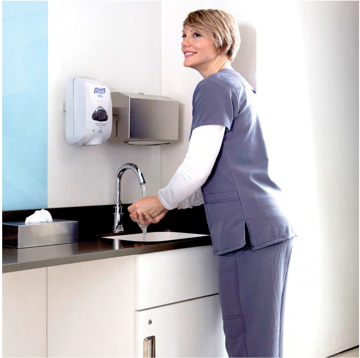
Above: Mile Marker modular cabinetry Right: Orchestra patient recliner, Quickstaker task, Mile Marker modular cabinetry