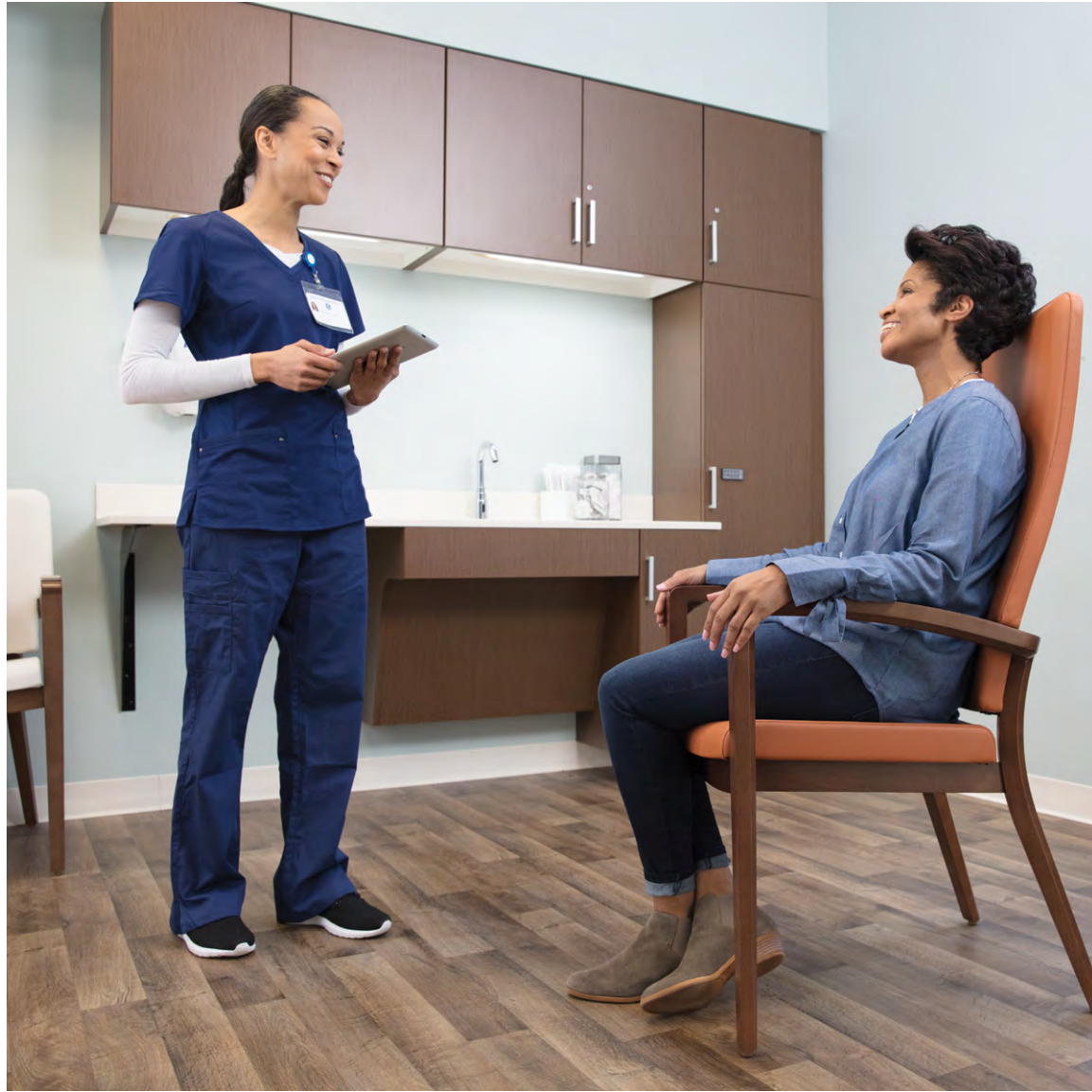
Above: Hug patient and guest, Mile Marker modular cabinetry Right: Whisper sleeper, Mile Marker modular cabinetry