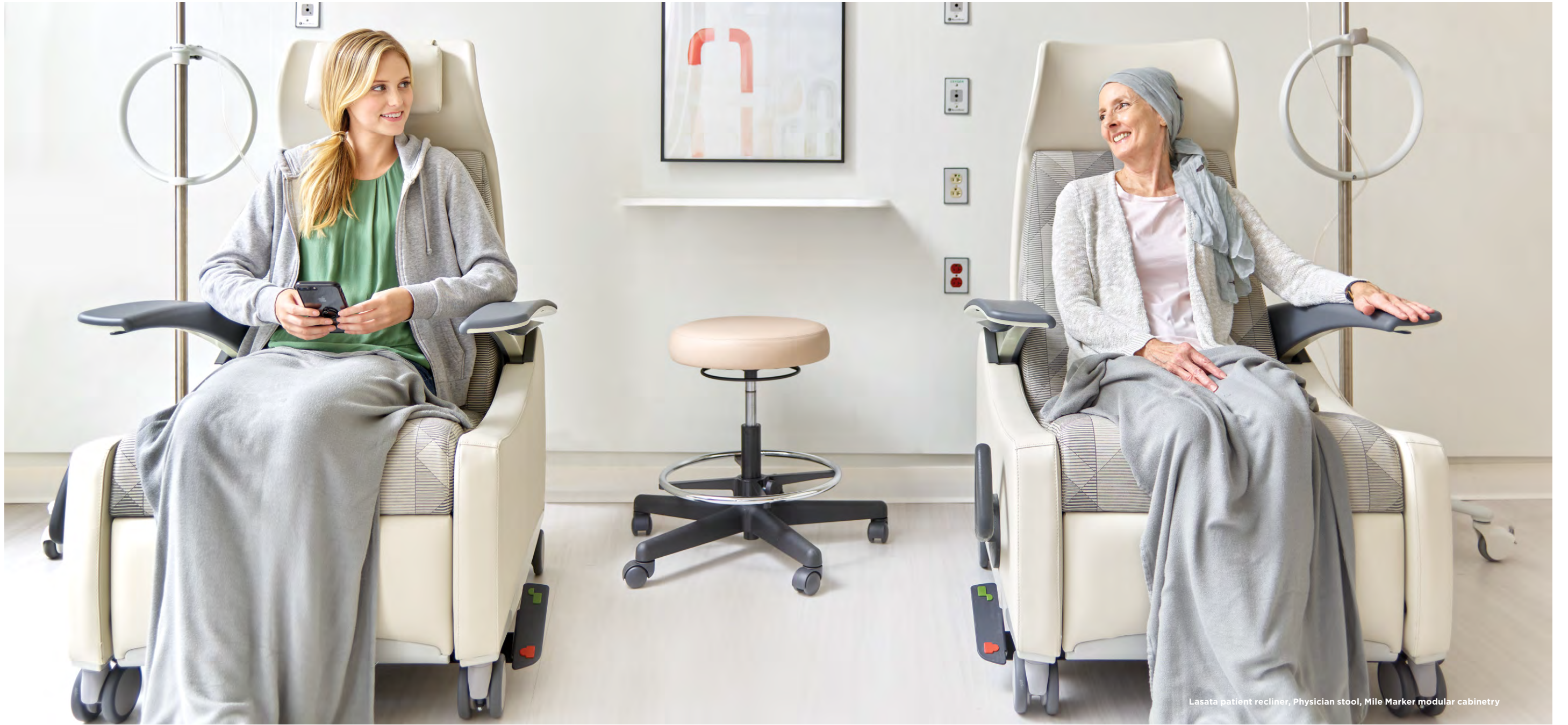
Lasata patient recliner, Physician stool, Mile Marker modular cabinetry