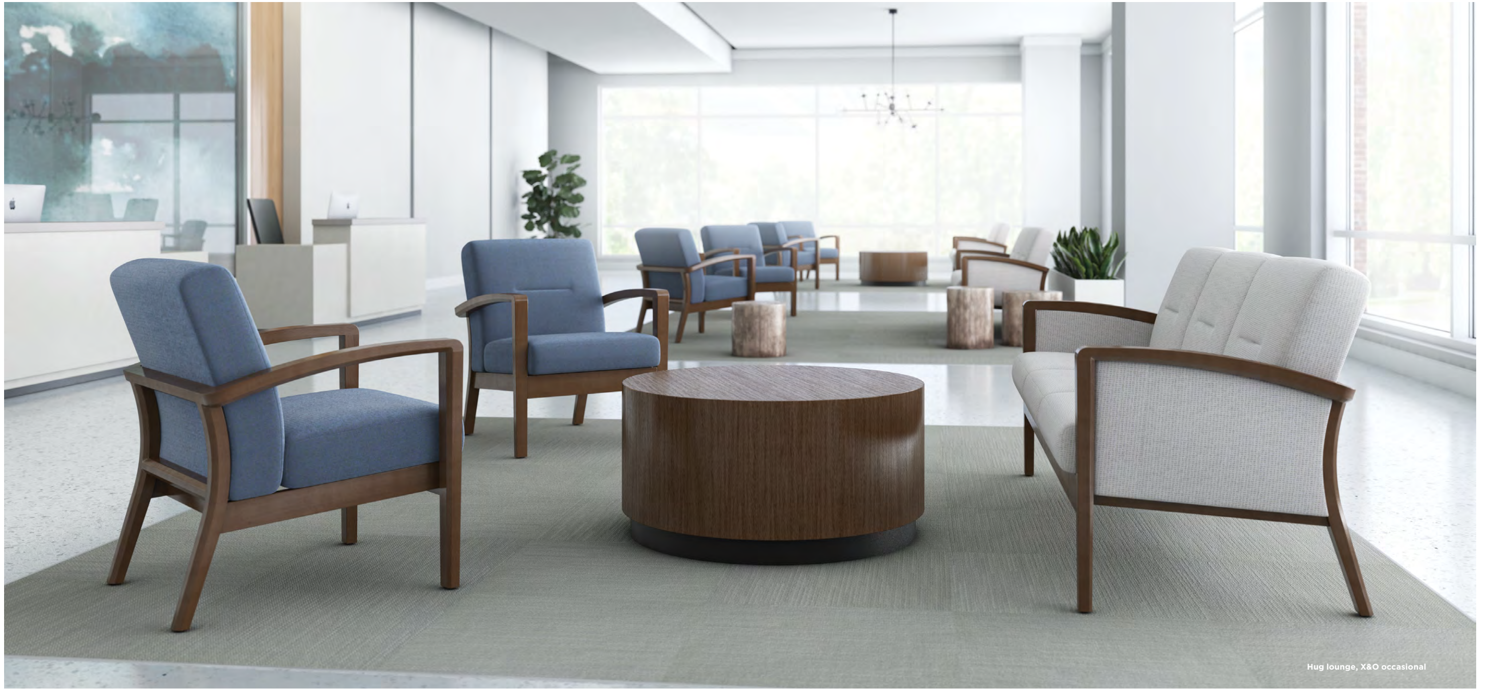
Hug lounge, X&O occasional