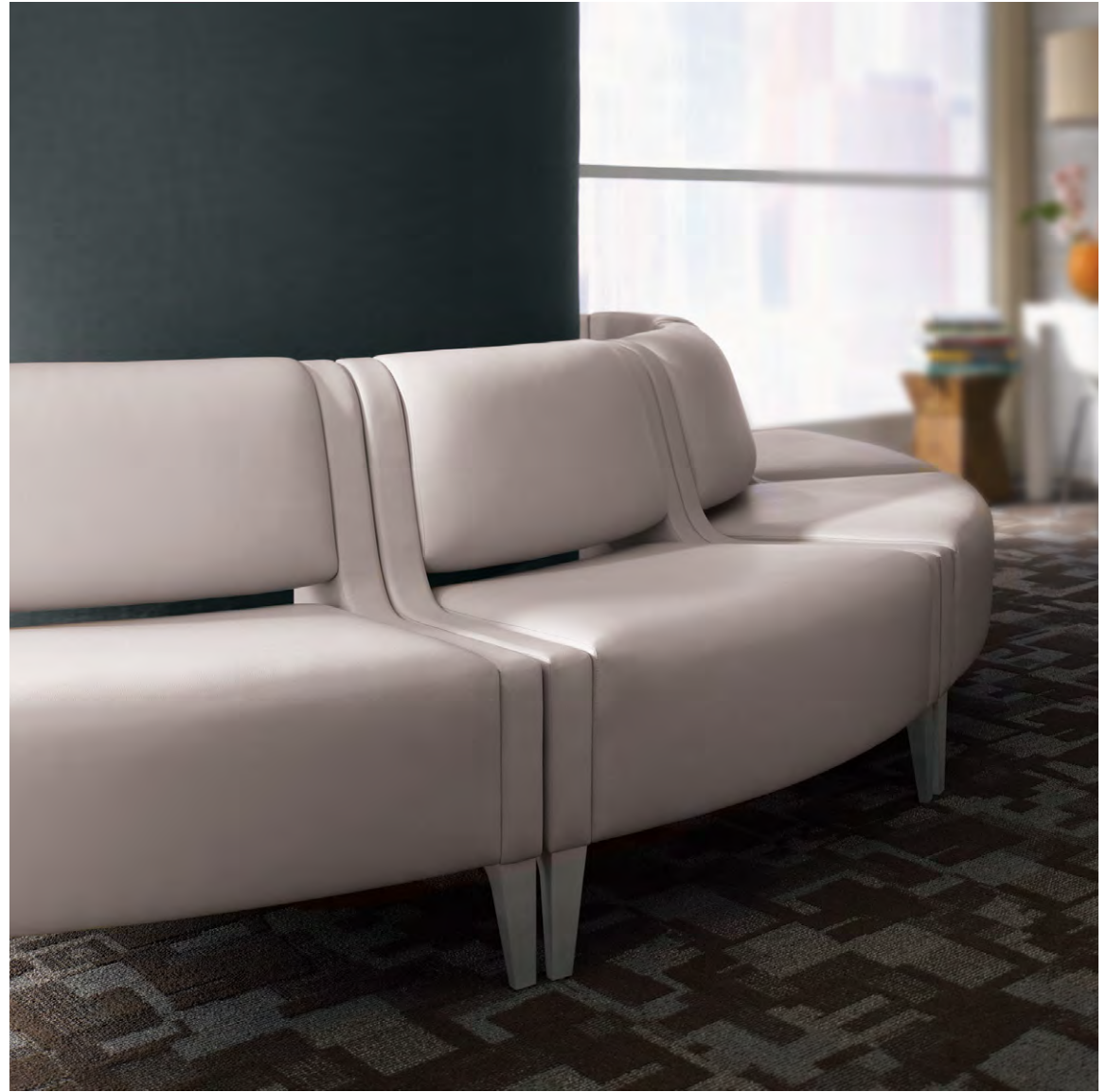
Above: Basil modular lounge Left: Embrace lounge