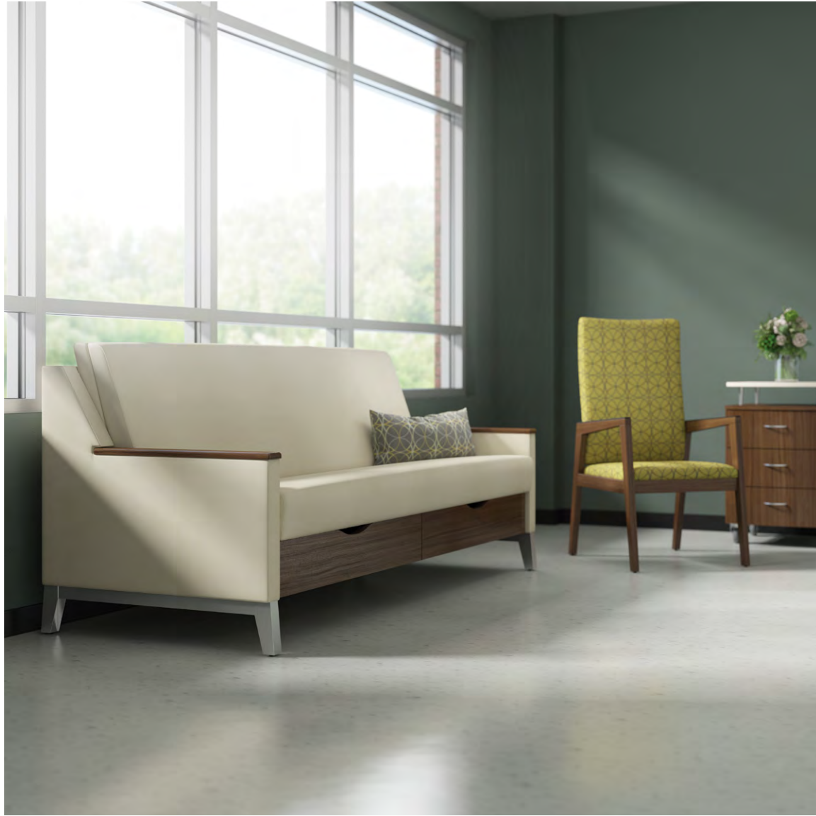
Above: Reverie sleeper, Rein+ patient, Senso bedside cabinet Right: Serony patient, Senso bedside cabinet, Physician stool, Over-the-bed table, Mile Marker modular cabinetry