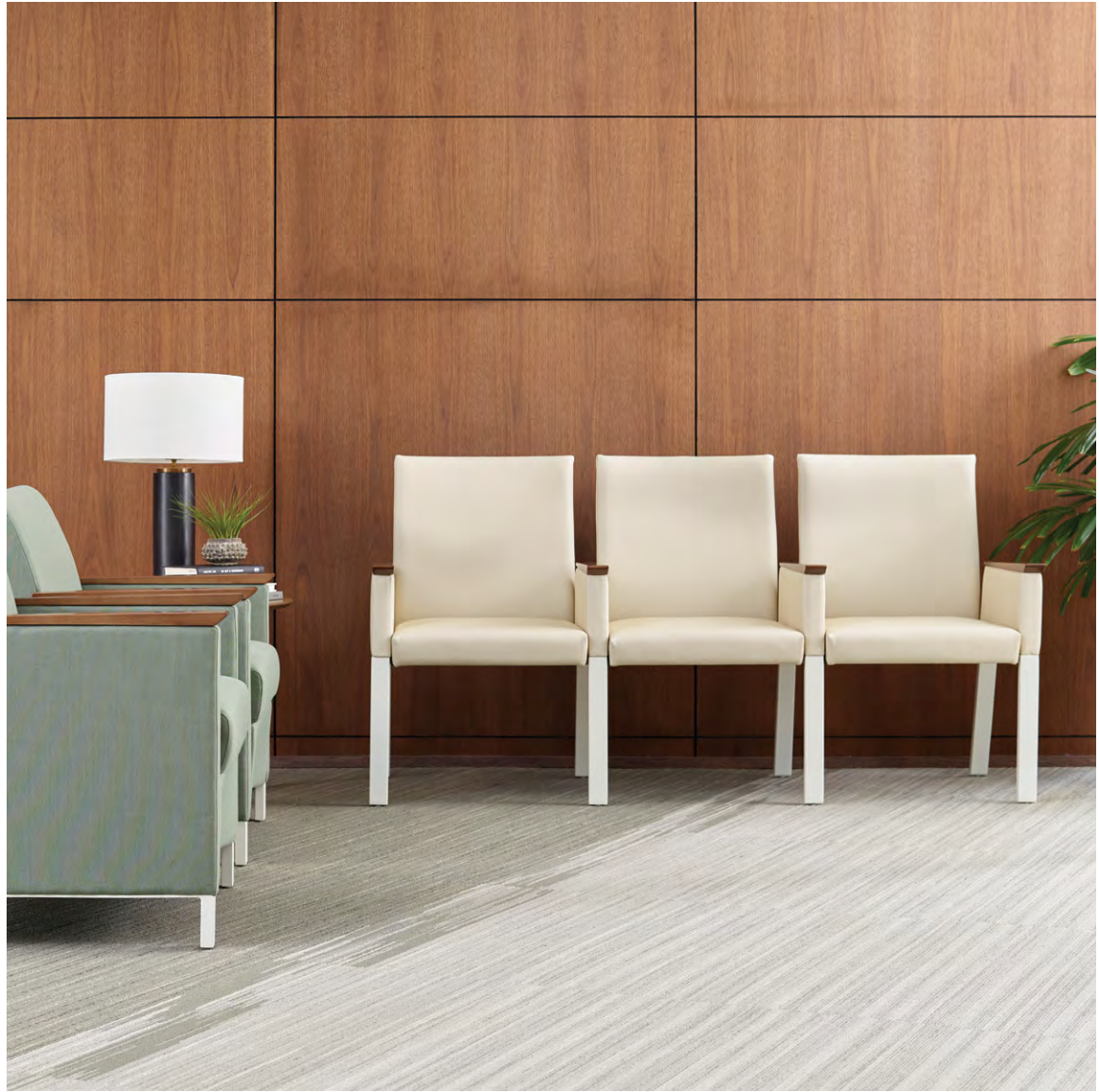
Interlude lounge and multiple seating