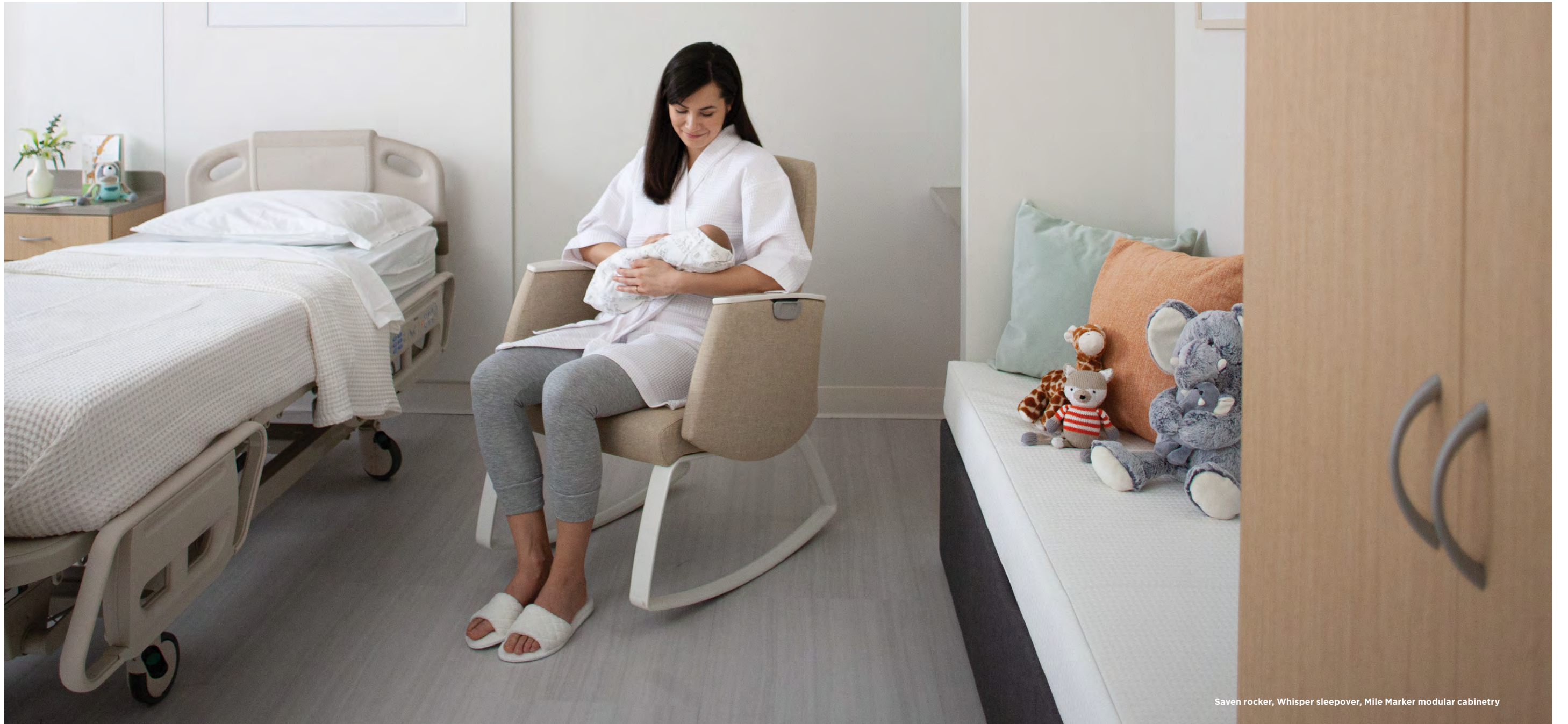
Saven rocker, Whisper sleepover, Mile Marker modular cabinetry