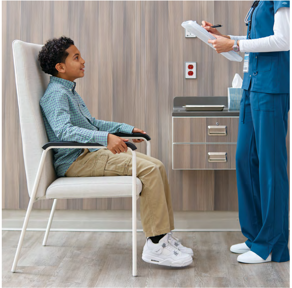
Above: Rule of Three patient, Mile Marker modular cabinetry Left: Lasata patient recliner, Mile Marker modular cabinetry, Physician stool