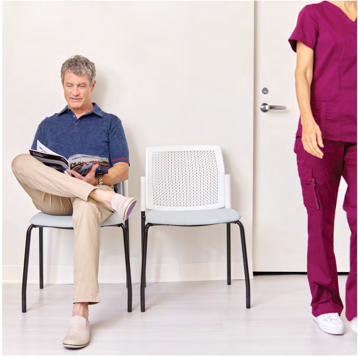
Above: Lado guest Right: Saven rocker, X&O occasional, Boost+ ottomans