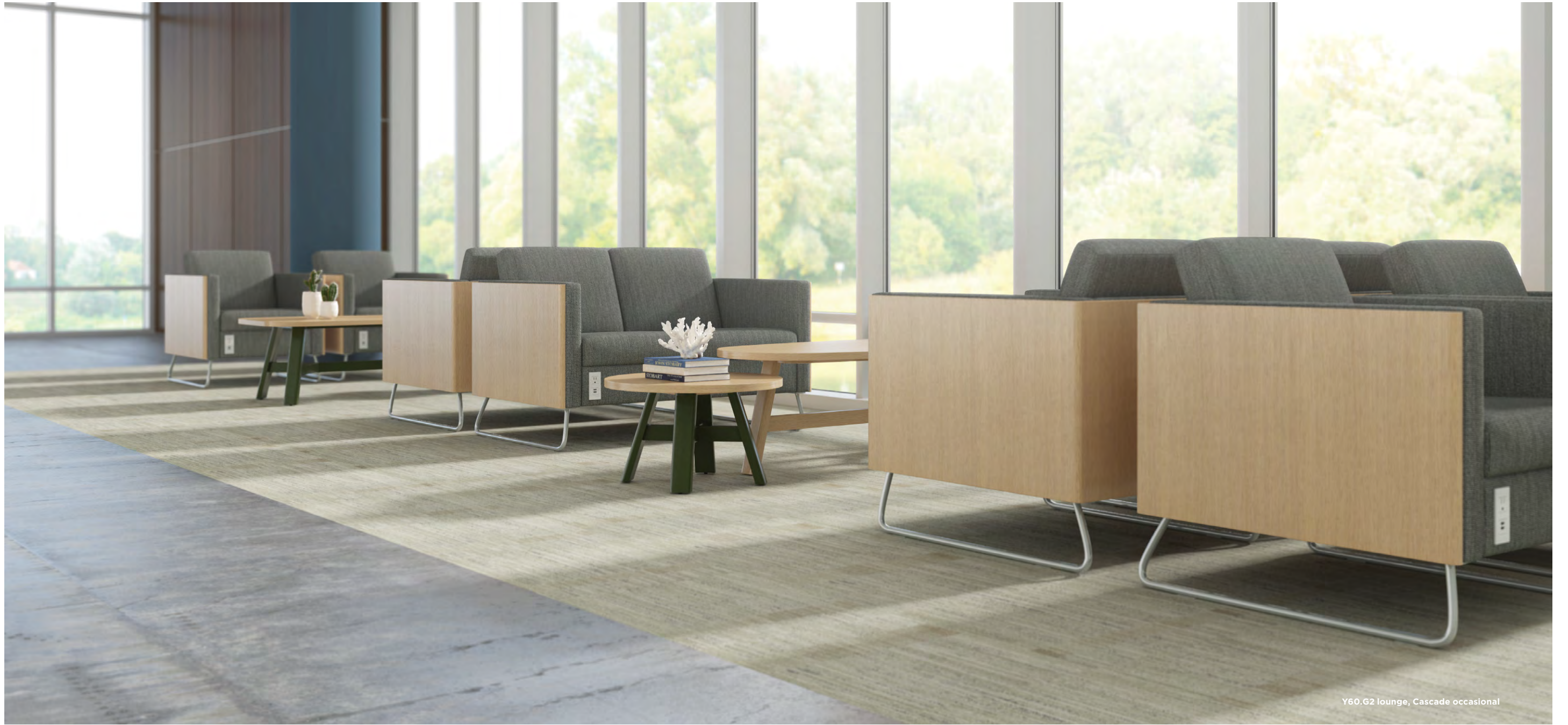
Y60.G2 lounge, Cascade occasional