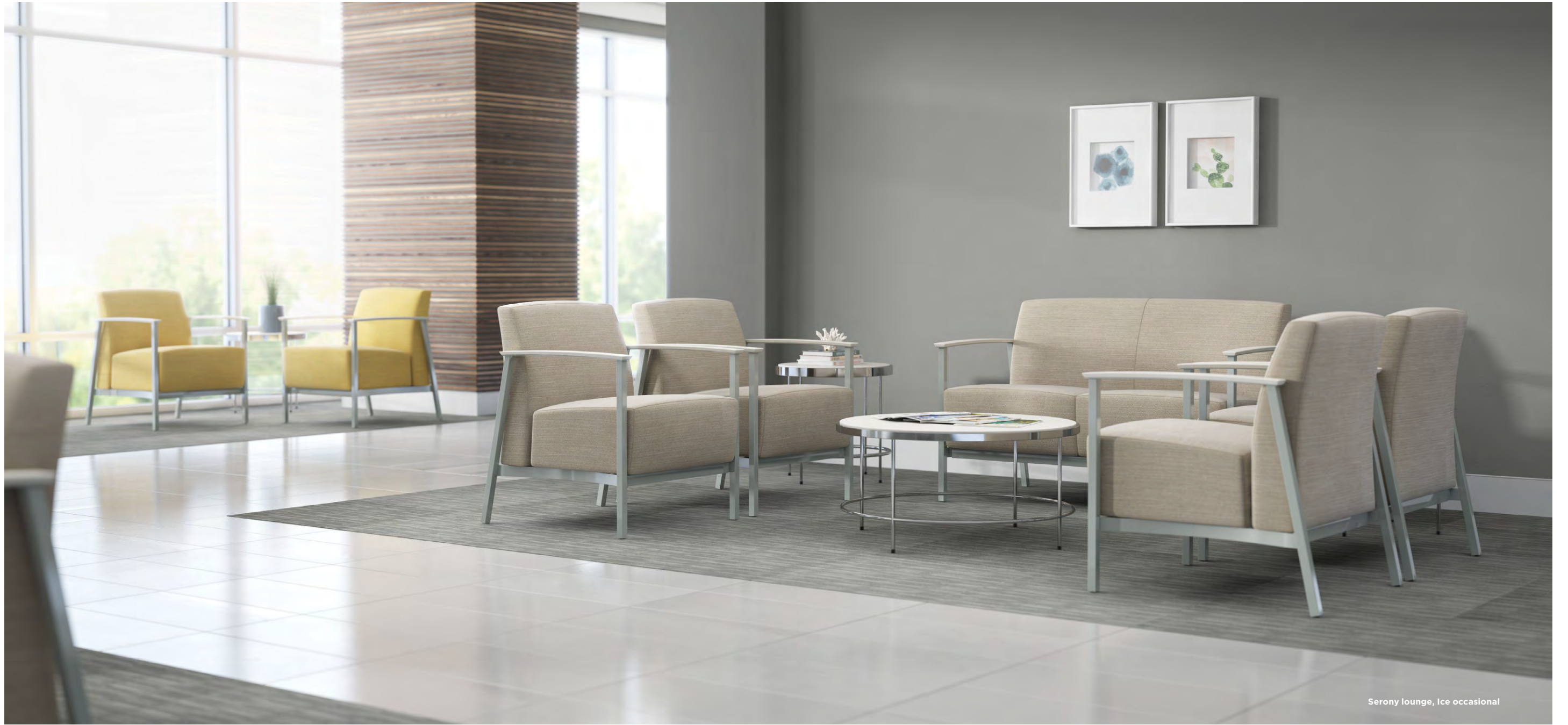
Serony lounge, Ice occasional