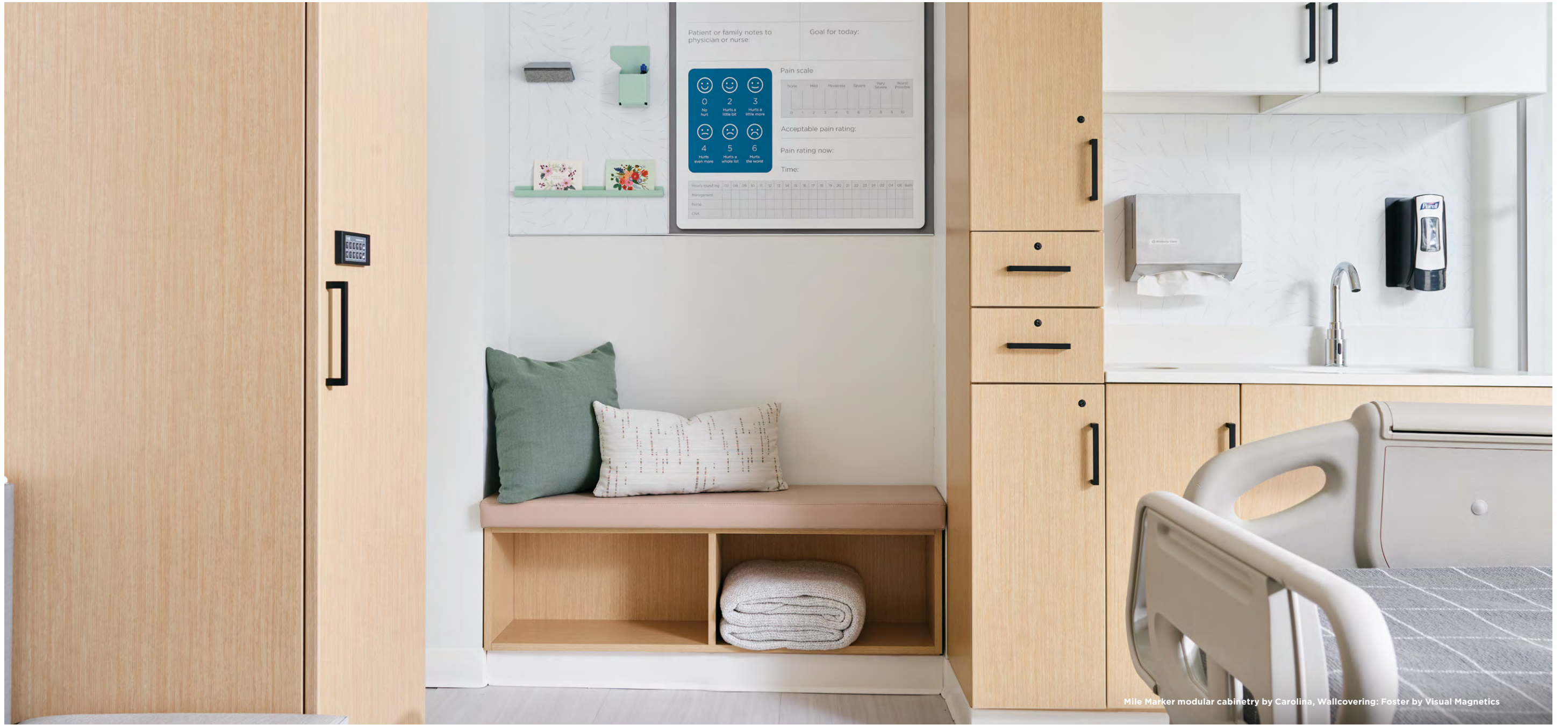
Mile Marker modular cabinetry by Carolina, Wallcovering: Foster by Visual Magnetics