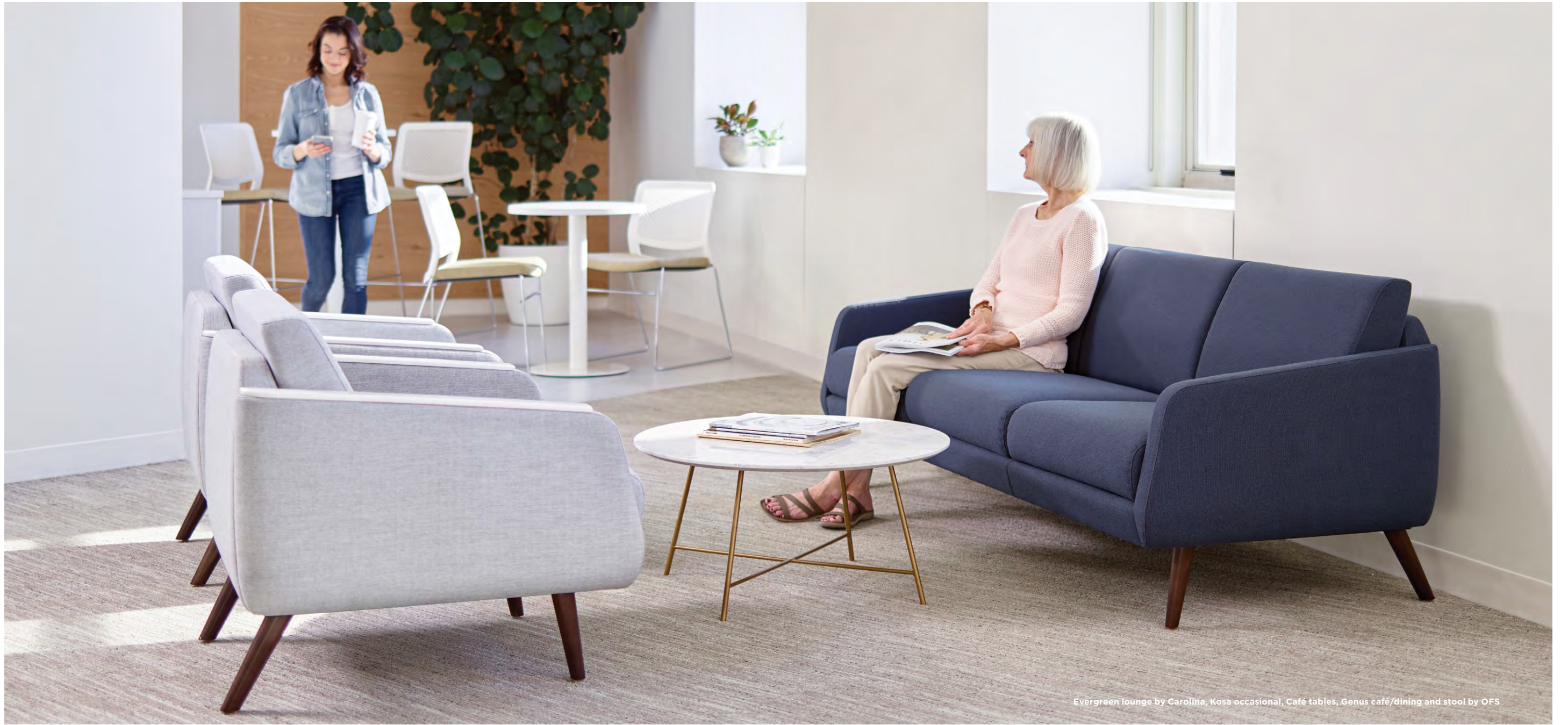
Evergreen lounge by Carolina, Kosa occasional, Café tables, Genus café/dining and stool by OFS