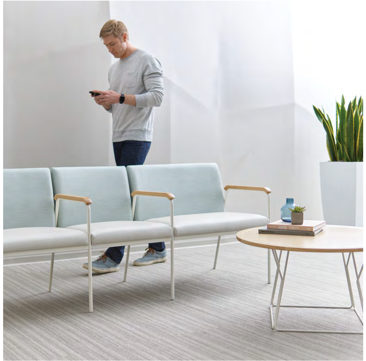
Above: Rule of Three multiple seating by Carolina, Wyre occasional by OFS Left: Voyage multiple seating