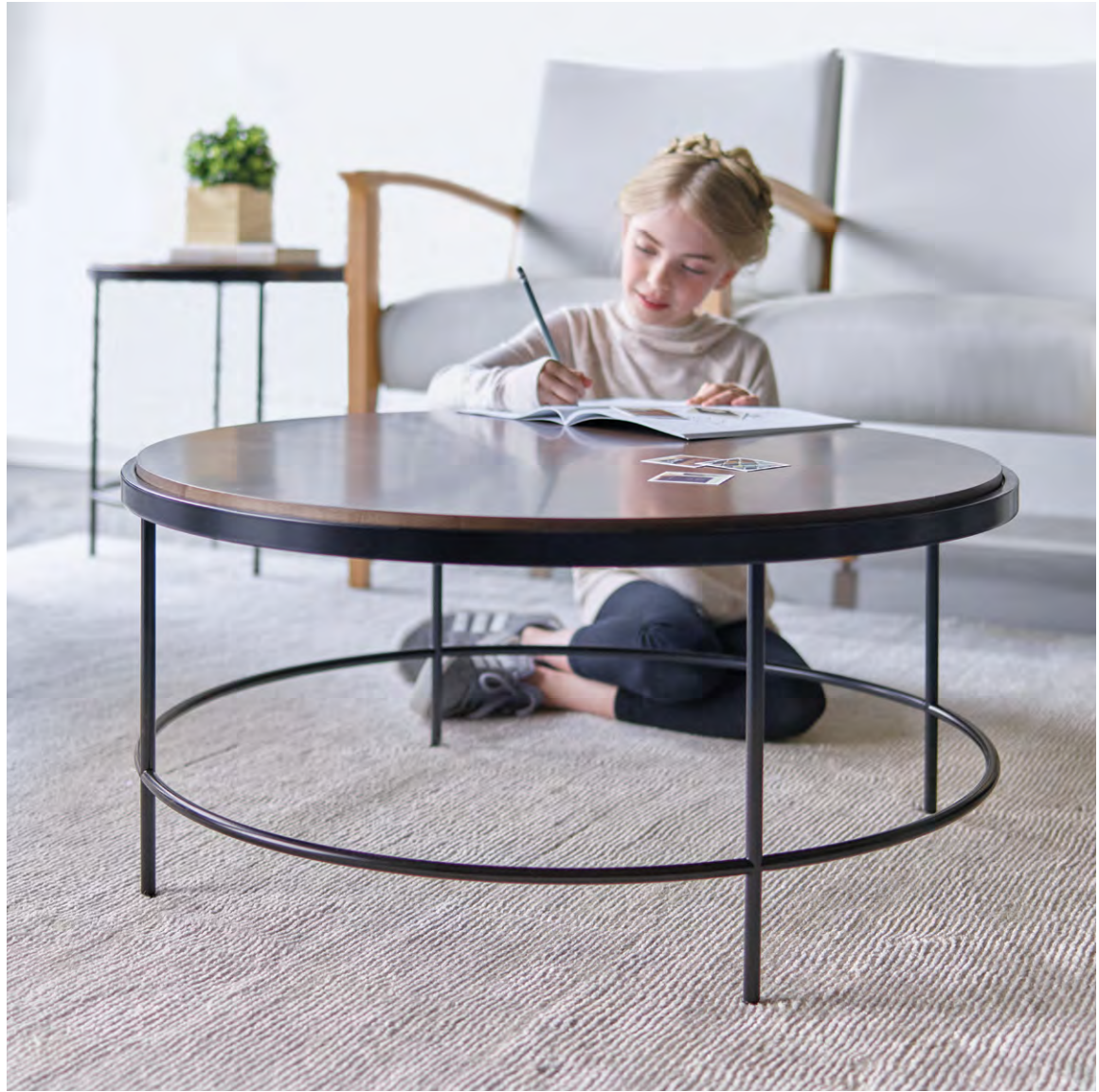
Above: Ice occasional, Orchestra multiple seating Right: Orchestra multiple seating