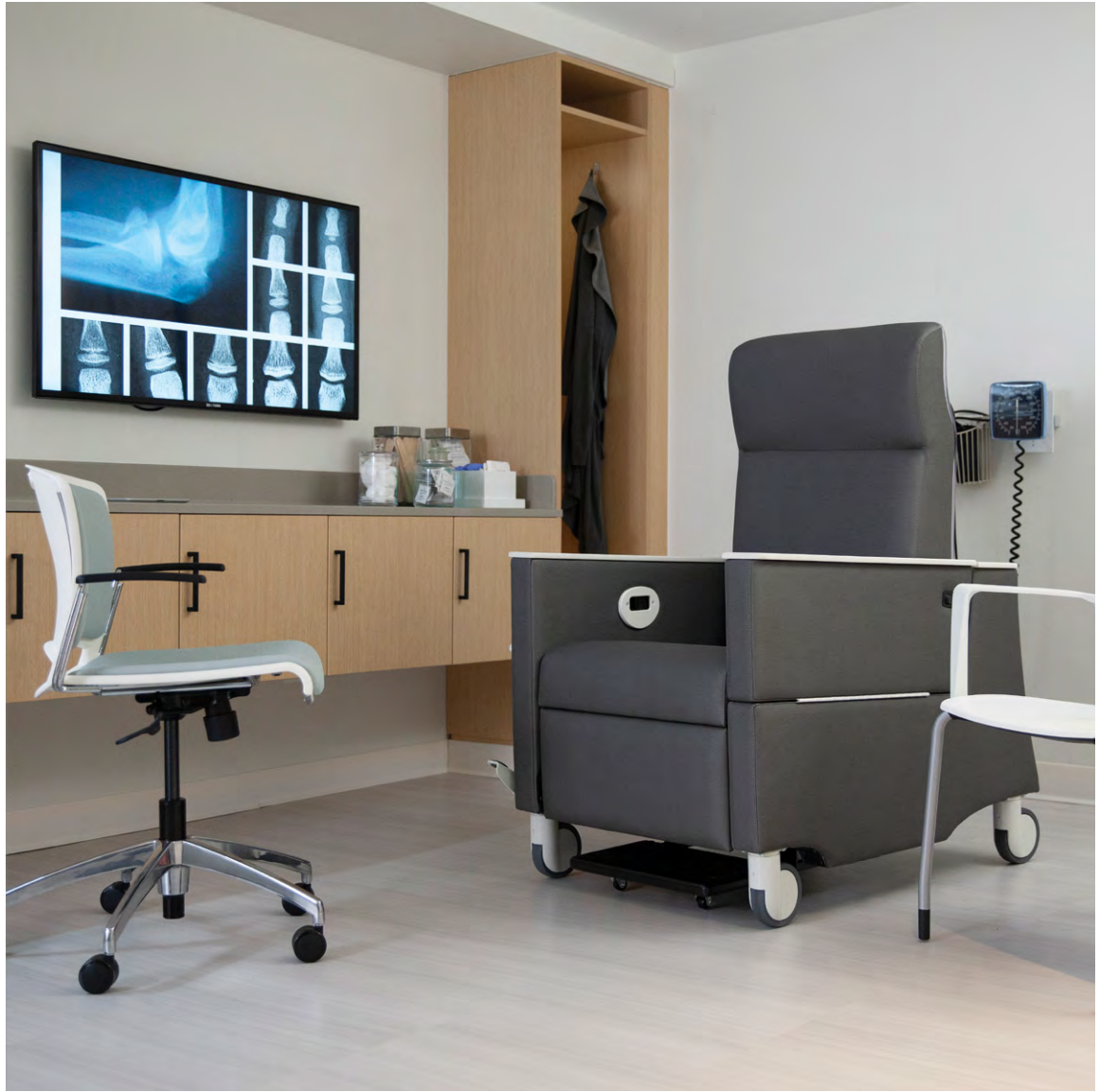
Above: Modern Amenity lite patient recliner, Quickstacker task, Lado guest, Mile Marker modular cabinetry Right: Senso bedside cabinet