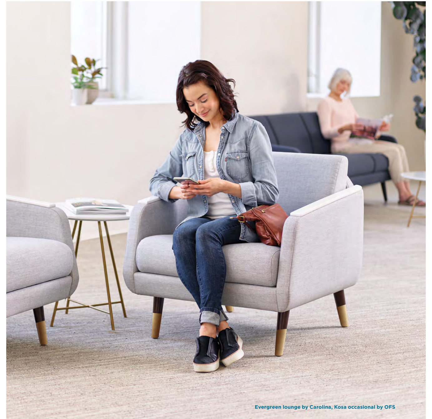
Evergreen lounge by Carolina, Kosa occasional by OFS

Public spaces are often times the most utilized spaces in healthcare facilities and play a vital role in the overall patient experience. Furniture in healthcare public areas should connect users to the space around them and allow them to be present in the moment.