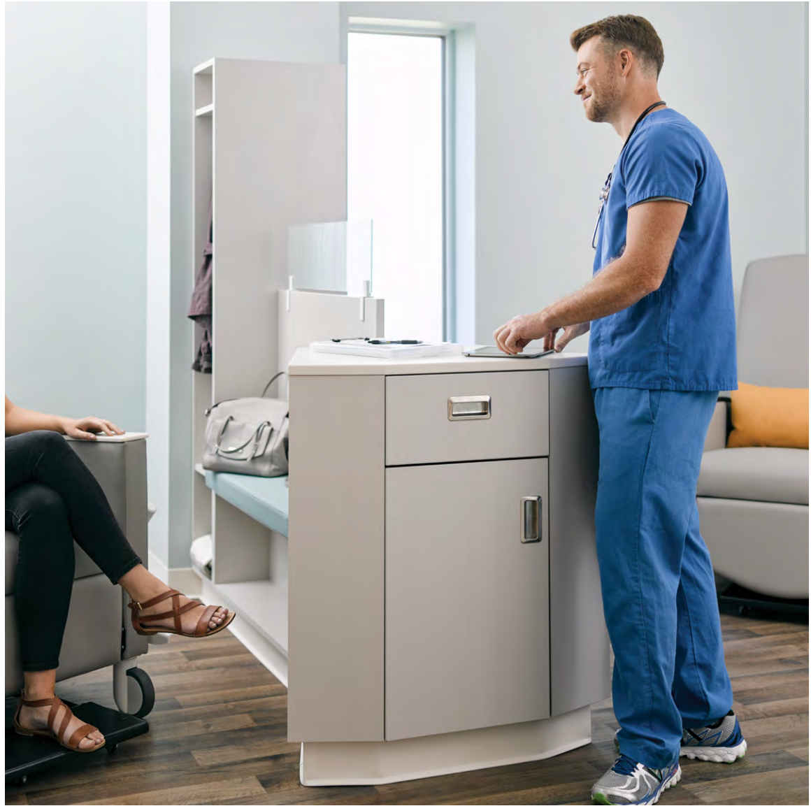
Above: Mile Marker modular cabinetry, Orchestra recliner Right: Custom nurse's station, Genus seating by OFS