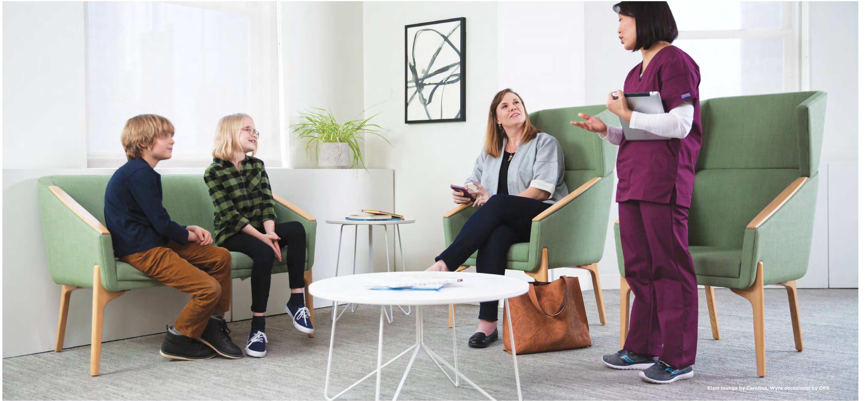
Elani lounge by Carolina, Wyre occasional by OFS