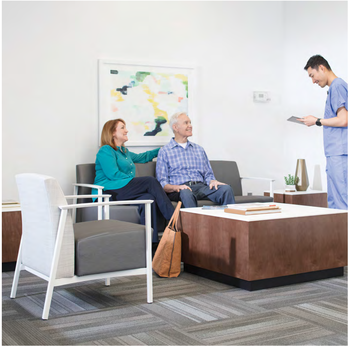
Above: Serony lounge, X&O occasional Right: Rein+ lounge and occasional