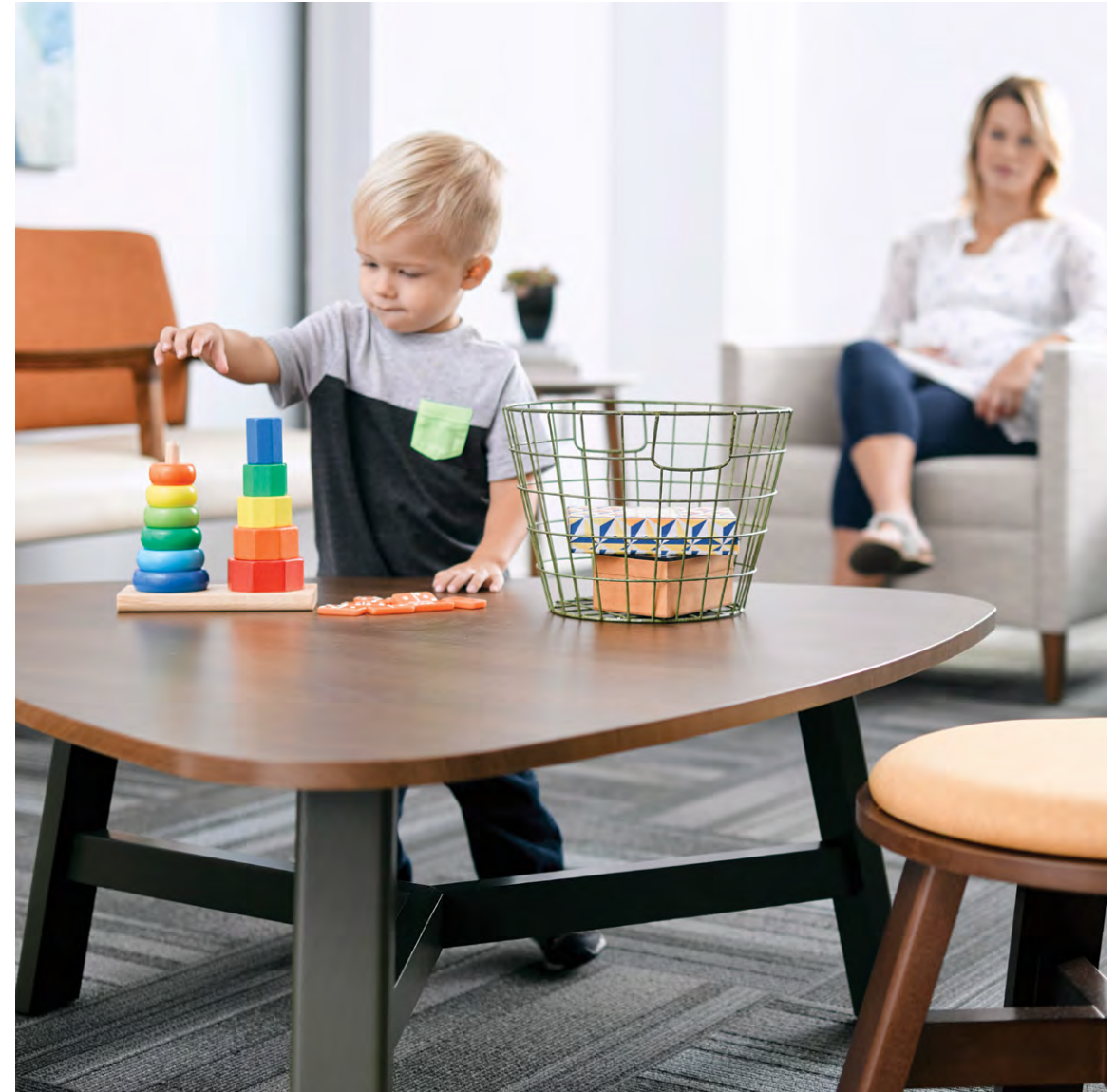
Cascade occasional, Modern Amenity lounge and multiple seating by Carolina, Heidi stools by OFS