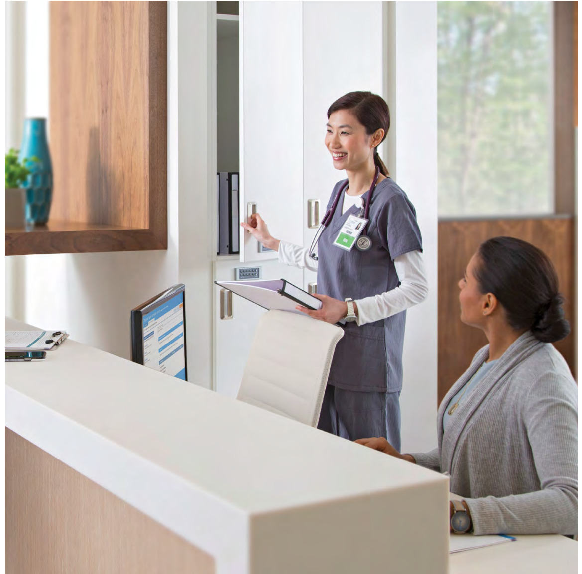
Above: Mile Marker modular cabinetry Left: Lasata patient recliner, Physician stool, Mile Marker modular cabinetry