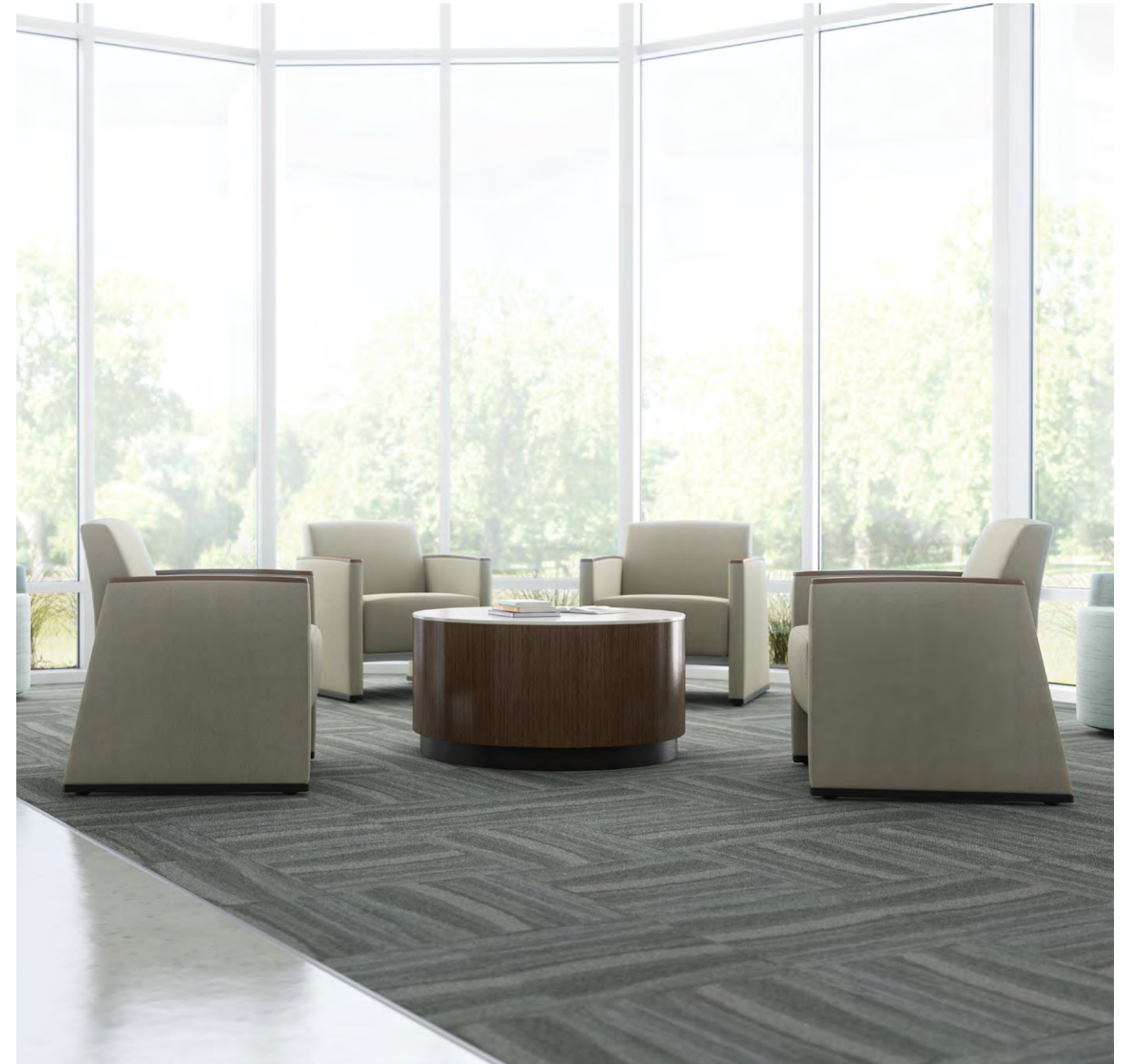
Above and Right: Boost+ ottoman, Serony Behavioral Health lounge, X&O occasional