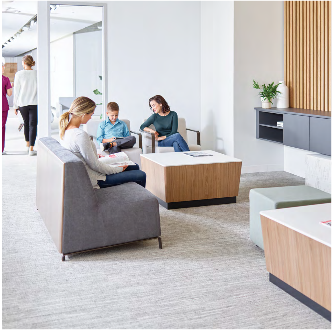
Above: Neom lounge, X&O occasional, Boost+ ottoman, Mile Marker modular cabinetry Left: Modern Amenity multiple seating and occasional, Y60.G2 lounge