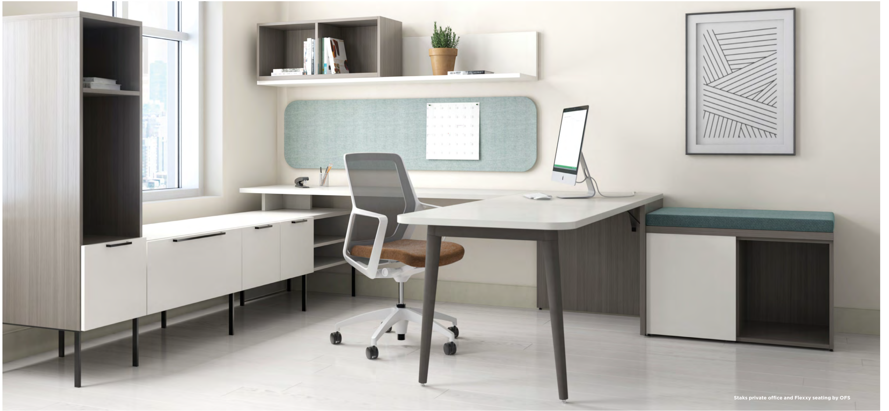
Staks private office and Flexxy seating by OFS