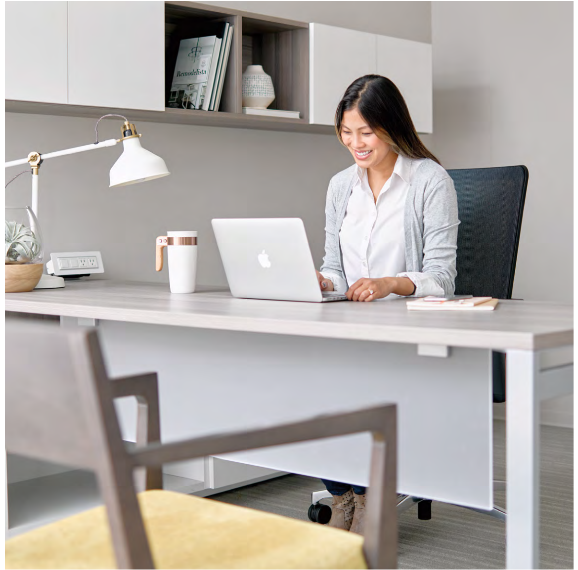
Above: Staks casegoods, Balance guest, Genus seating Left: Lynx+ guest by Carolina, Intermix huddle table by OFS