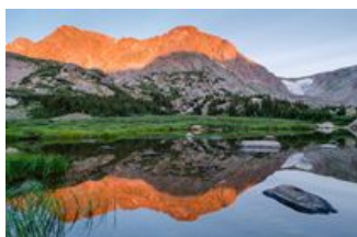
Rocky Mountain National Park

Applications are now open for a one-day pedagogy workshop on integrating Latin American and Caribbean history of science into teaching in adjacent fields. The free workshop will be held on April 3, 2024, just before the ASEH conference in Denver, Colorado. RECSLAC (Red de Ciencias y Saberes en Latinoamérica y el Caribe, Network on Sciences and Knowledges in Latin American and the Caribbean) will offer scholarships to offset the cost of travel to the workshop and attendance at the ASEH meeting.