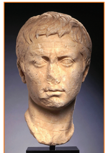
Roman, Augustan: Portrait of the Emperor Augustus, ca. 27–1 B.C. Carrara marble, h. 40.5 cm., w. 23.2 cm., d. 24.0 cm. Museum purchase, Fowler McCormick, Class of 1921, Fund (2000-308) (photo: Bruce M. White).