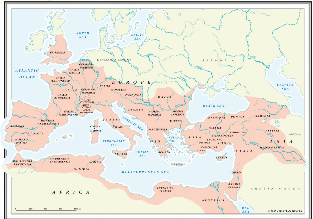
ROMAN EMPIRE, AD 117

We are very fortunate to have some of these objects at the Princeton University Art Museum. By examining these ancient treasures, we can learn about what life was like in Ancient Rome. The Roman gallery is on the lower level of the museum. Walk down the stairs and turn to your right. Then make a left and walk through the doorway into the Roman gallery.