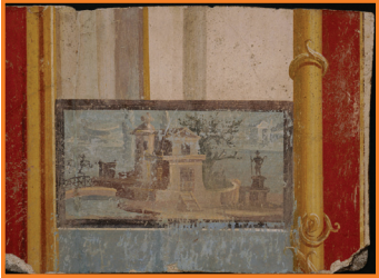
Roman. Section of wall painting with landscape, 1st century A.D. Fresco; h. 32.2 cm., w. 45.6 cm., d. 1.4 cm. Museum purchase, Fowler McCormick, Class of 1921, Fund (1999-149)

On the side wall is a small case with a piece of painted fresco—the Roman version of wallpaper. Fresco was actually painted on the plaster when the walls of the villa were made. Close your eyes and imagine a room with a painting like this all over the walls and a mosaic on the floor.