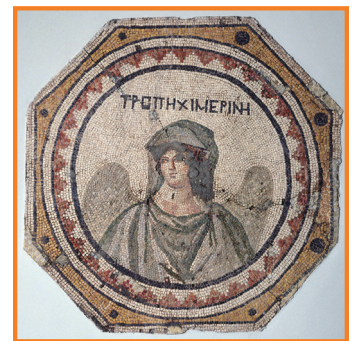
Roman, Turkey, Antioch on the Orontes. Mosaic pavement from Antioch (Daphne): Winter, mid-2nd century A.D. Stone; h. 135.0 cm., w. 132.0 cm. Gift of the Committee for the Excavation of Antioch to Princeton University (y1965-210)