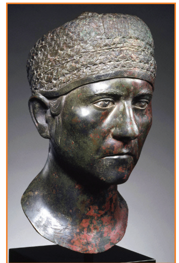
Roman, Italy, Trajanic. Portrait head of a woman, A.D. 98–117. Bronze with silver inlay; h. 32.8 cm., w. 17.4 cm., d. 20.4 cm. Museum purchase, Fowler McCormick, Class of 1921, Fund (y1980-10)