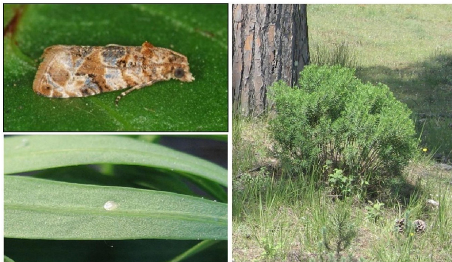
Fig. 1: Left, Lobesia botrana female (above) and its egg (beneath) laid on a leaf of Daphne gnidium . Right. A shrub of D. gnidium in the Migliarino-San Rossore-Massaciucoli Nature Reserve.

To date, twelve species of Trichogramma have been reported as natural egg parasitoids of EGVM (NOYES 2003). The Universal Chalcidoidea Database lists eleven species of Trichogramma Westwood, 1833 and one species of Trichogrammatoidea Girault, 1911, tested on L. botrana eggs in laboratory trials. Another species of Trichogramma was found on EGVM eggs in Iran (EBRAHIMI and AKBARZADEH-SHOUKAT 2008, LOTFALIZADEH et al. 2012).