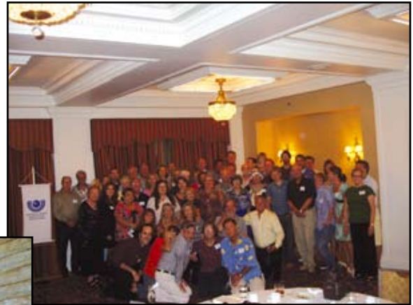
Oklahoma Society birthday celebration