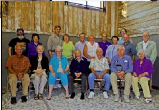
Fort Wayne, Indiana