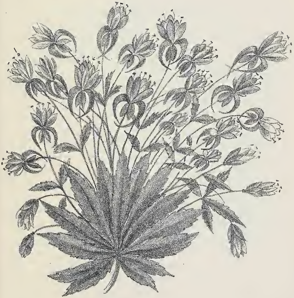
I S O I N A