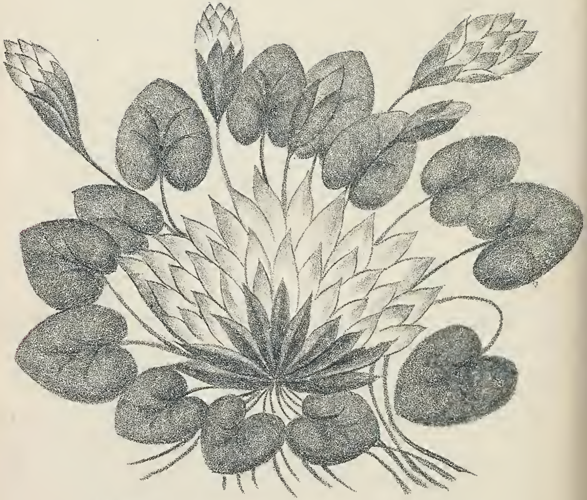
R O D E L. THE NATIONAL FLOWER.