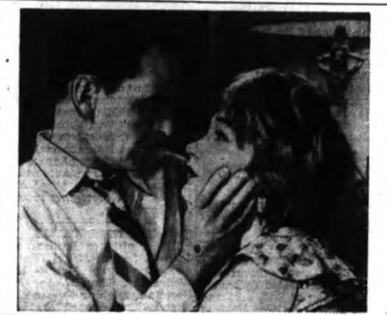
"SOME CAME RUNNING," starring Frank Sinatra and Shirley McLaine, will be showing at the Balboa Theatre next week, Wednesday through Saturday. This is the MGM film version of the best-selling novel by James Jones.