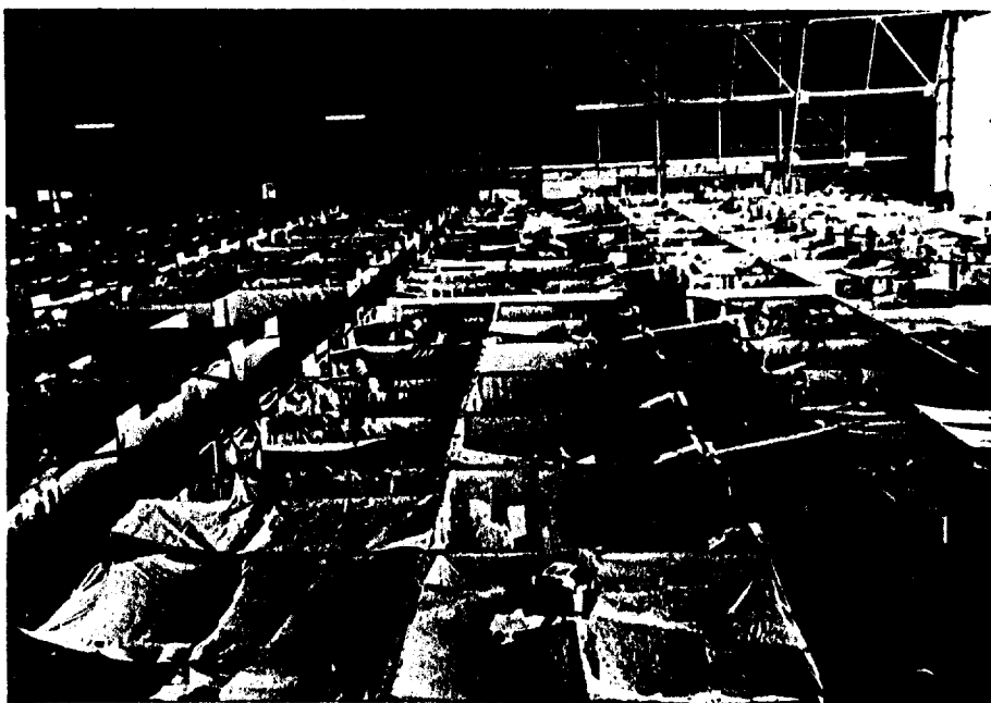
Figure I.2: Cubicles Inside the Albrook Facility

consisting of more than four members are provided additional cubicles. Figure I.2 shows the confining conditions at the Albrook facility as of August 1990.