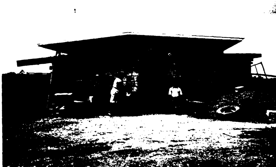
Figure II.3: House in Villa Lochin

Some drawbacks associated with this choice include inadequate public transportation, no secondary schools, and limited shopping and medical services in the area. The lots being provided can be up to 15 kilometers from the center of the city. Main artery transportation links are approximately a mile away. We were told that primary schools are located in the area and that secondary schools are planned. We were also told that once the project is completed, private bus service 2 may be available, but increased availability of health facilities, and shopping remains a question at this time. Areas are included in plans for these purposes: however, there is no guarantee that the infrastructure development will occur. Some individuals already in the housing units found the lack of such facilities to be a problem, others did not. All of those with whom we spoke said that they wanted the larger units and could deal with inconveniences of being outside the city center.