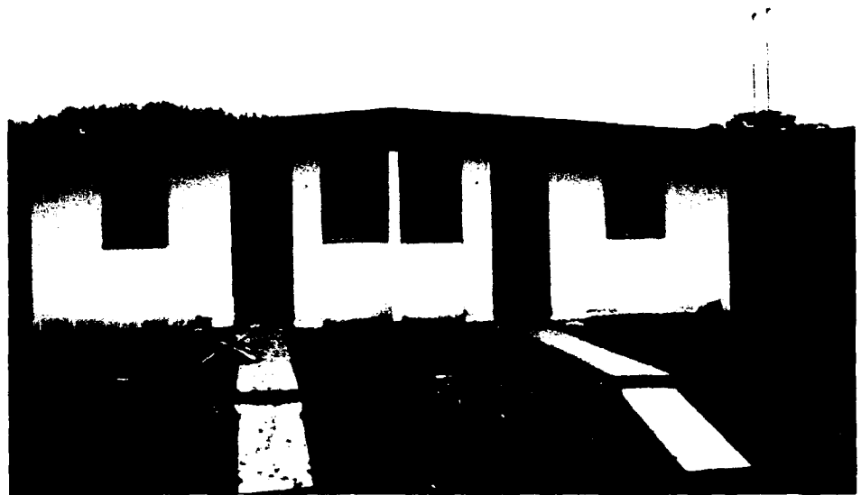
Figure II.2: Duplex Housing in Vista Alegre #2

developer. Figures II.2 and II.3 show two housing alternatives currently available to displaced families under this option. As of November 5, 1990, 946 family groups had selected this option.