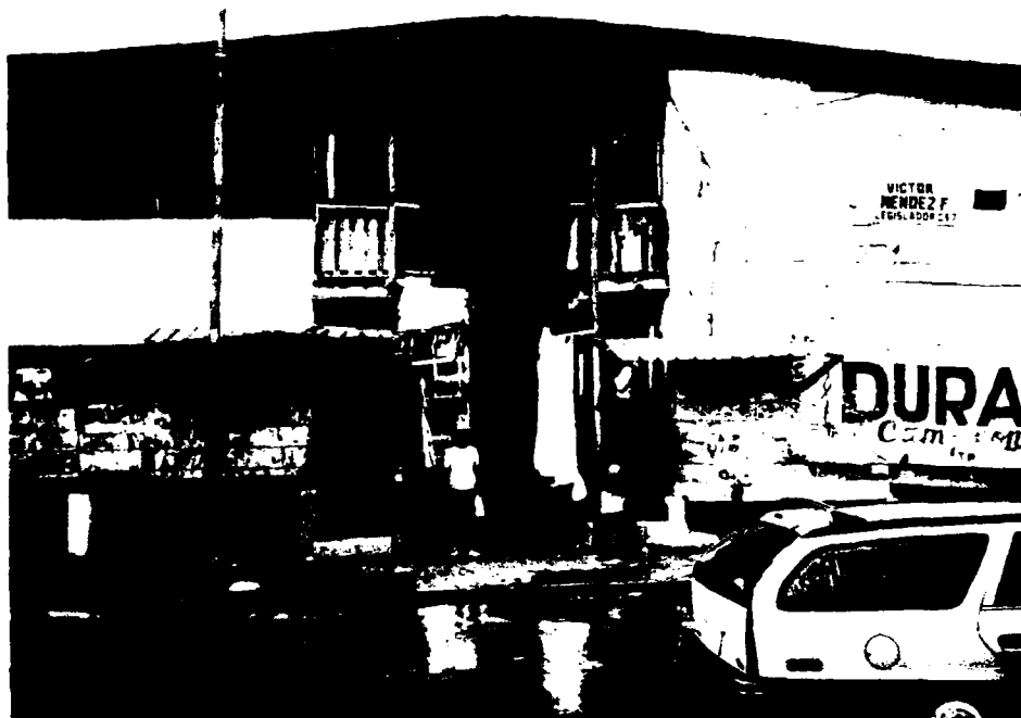
Figure I.1: Typical El Chorrillo Multifamily Residence Before the December 1989 Fighting

U.S. military personnel encouraged civilian residents to evacuate designated danger areas from the outset of the battle in El Chorrillo. By midday December 21, 1989, most residents had arrived in a displaced persons area established by the U.S. military on the grounds of Balboa High School, about 1 mile from El Chorrillo.