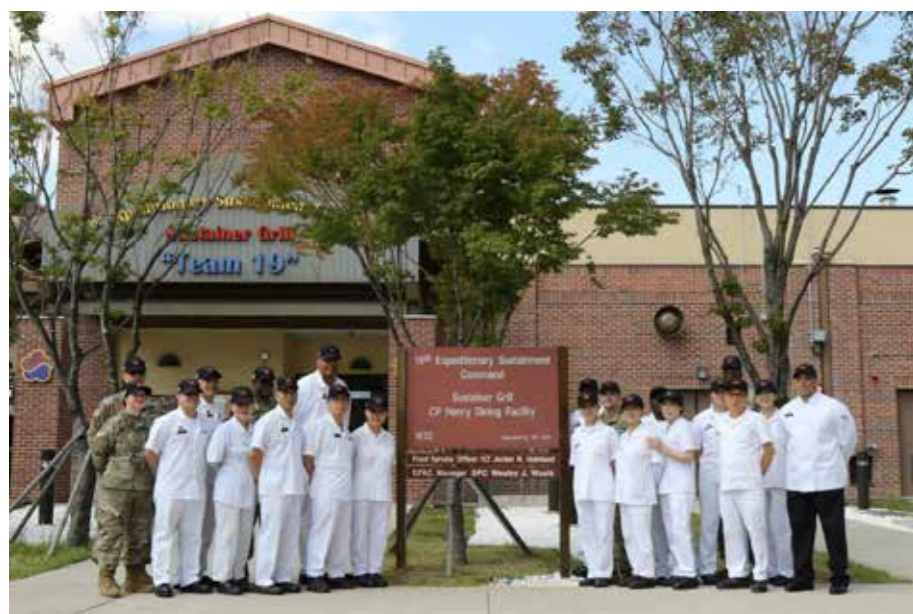
Sustainer Grill team, Headquarters and Headquarters Company, 19th Expeditionary Sustainment Command, Camp Henry, Korea poses for a group photo as part of the 49th Annual Philip A. Connelly Awards Program, Active Military Garrison Category competition.