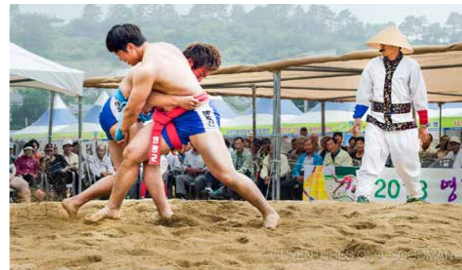
Ssireum is a Korean traditional sport mainly played during Chuseok. Pulling on the opponent's "satba" and throwing them to the ground so that their upper body touches the ground is the ultimate goal of this game. The winner is called "Cheonha Jangsa" and is rewarded with a bull and 1 kg of rice.