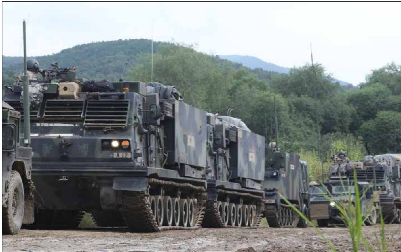
Near South Korea's Hantan River earlier this month, vehicles of Battery A, 6th Battalion, 37th Field Artillery Regiment, prepare to roll out in convoy as they move from one combat training area to the next during a fast-paced stint of battle drills the unit conducted Sept. 10 through 15. Members of the battery said the realistic training helped show them the need to be ready to adapt immediately to the rapid changes of battle, and of the crucial need to keep the fight going even when their team takes casualties. The unit is part of the 2nd Infantry Division/ROK-US Combined Division's 210th Field Artillery Brigade.