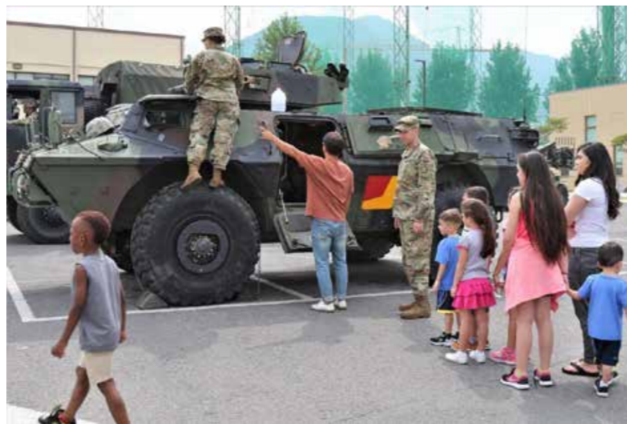
Boys and girls wait in line to see military vehicles during the Boys and Girls Clubs of America annual “Day for Kids” event September 9, 2017 at Camp Walker, Korea. Children were allowed to enter the vehicles to see first-hand the equipment Soldiers use during the daylong event.