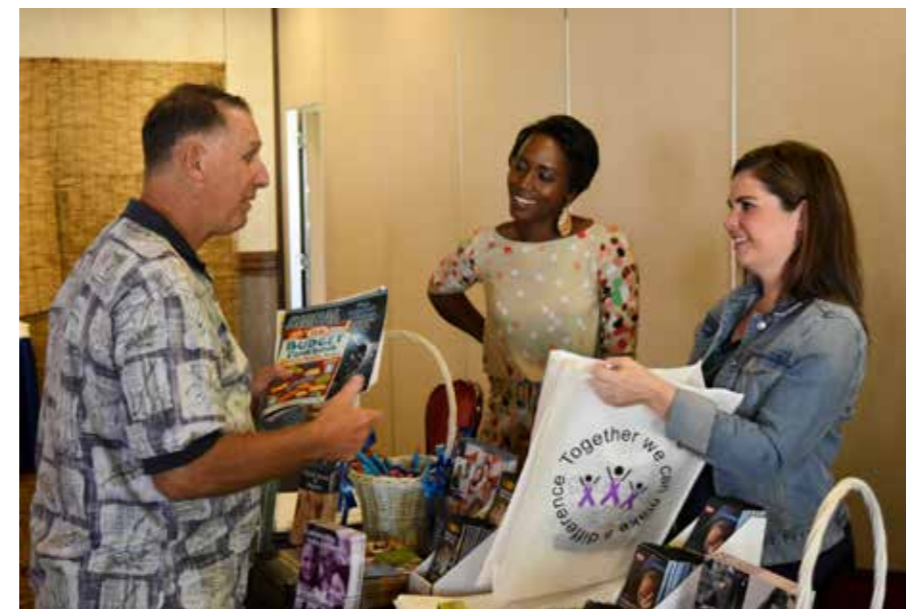
Representatives from Army Community Service Family Advocacy talk to a potential employee during the 2017 Community Job fair at the Camp Walker Evergreen Club, Sept. 14.