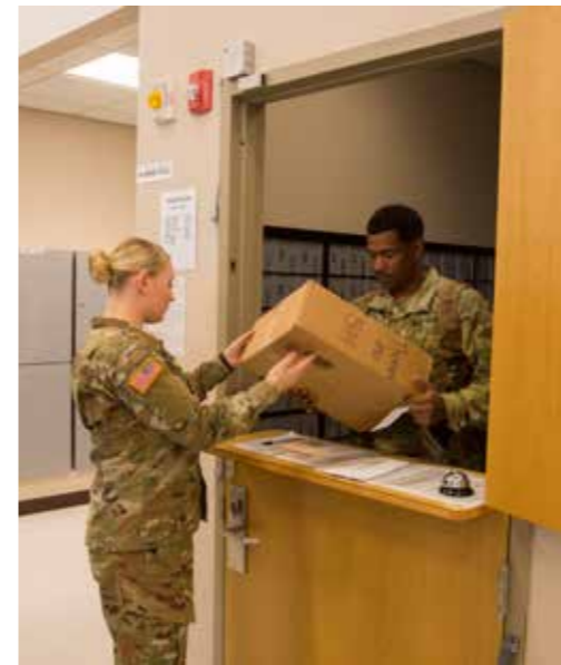
Also located in building P-6809 is a Postal Service Center that offers 8,700 mail boxes accessible 24 hours a day to assigned personnel. The PSC operates a package pick-up window Monday to Friday from 10 a.m. to 5:45 p.m. and Saturday from 10 a.m. to noon.