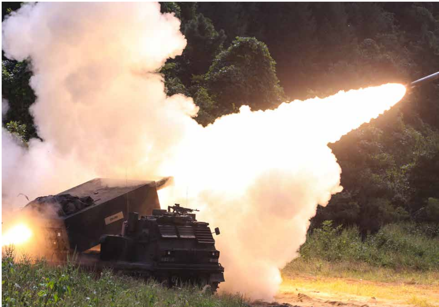
In “Rocket Valley” in Chorwon Sept. 15, one of the U.S. Army’s M270A1 mobile rocket launchers sends a rocket roaring downrange during a live-fire drill that climaxed a week of fast-breaking combat training for Soldiers of a Multiple Launch Rocket System, or MLRS, battery. The unit, Battery A, 6th Battalion, 37th Field Artillery Regiment, is part of the 2nd Infantry Division/ROK-US Combined Division’s 210th Field Artillery Brigade. The training stint included a variety of battle drills that helped the battery’s Soldiers hone the skills they’d need in actual combat.

Read the latest news from the Army in Korea online at: www.Army.mil