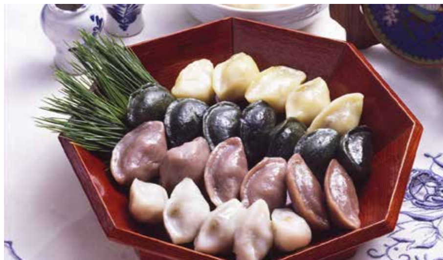
Songpyeon is a Korean traditional rice cake filled with sesame seeds, black beans and honey. Steaming them below or on pine needles contribute greatly to their aromatic fragrance, beauty, and taste. The procedures of making songpyeon is simple, allowing all family members to gather around and participate in making them.

Every year, the Korean peninsula witnesses large crowds of people heading to their hometown to spend Chuseok with their families. During this time, the public must be aware of traffic conditions and avoid becoming mired in severe congestion on major arteries leading into and out of cities and burial sites. Accidents are common, and public transportation is highly recommended. Bus lanes allow large-capacity vehicles unfettered access on major highways. Strict enforcement of these lanes by helicopters and drones result in heavy fines for passenger cars and other unauthorized users of the bus lanes. ▴