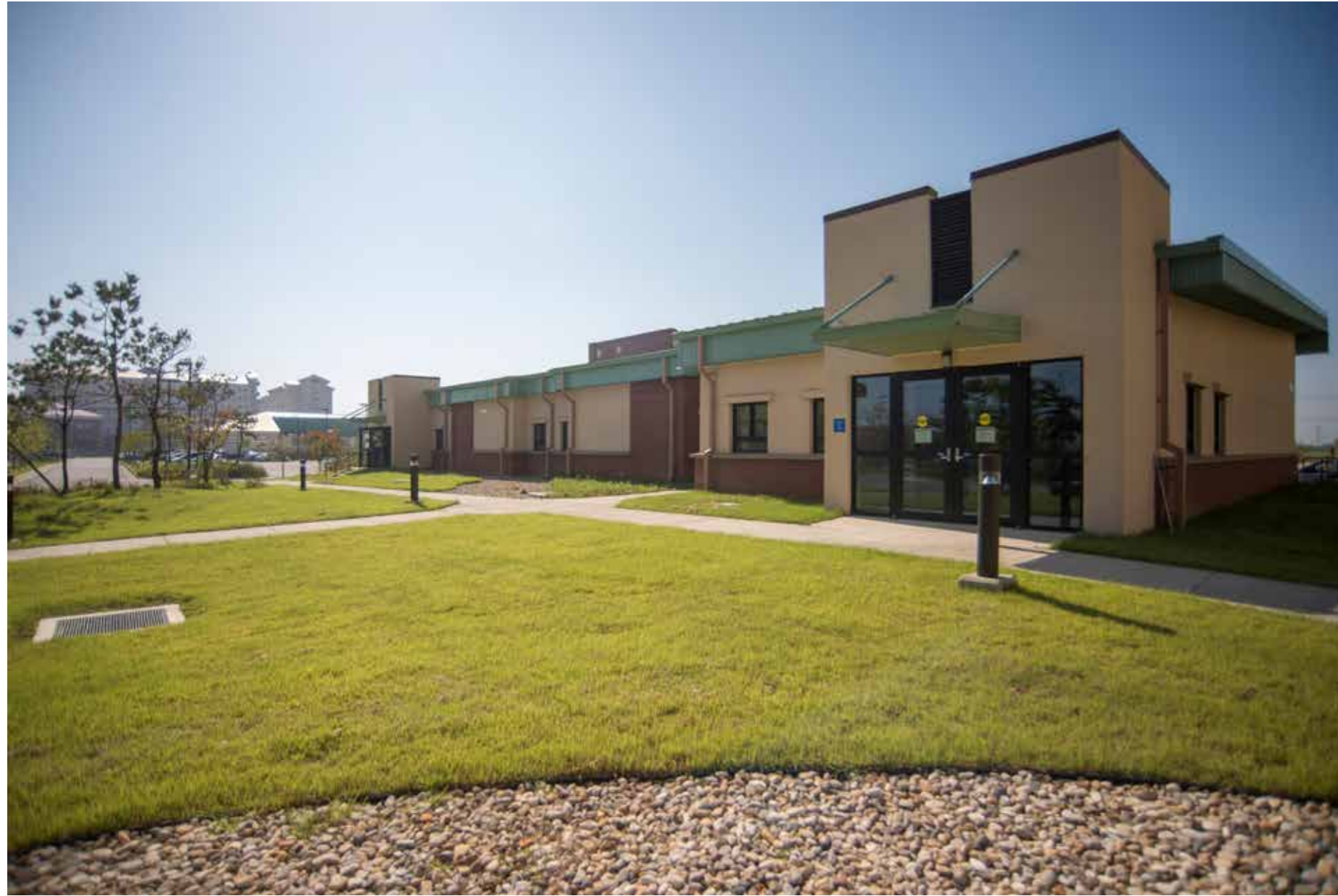
The Richard E. Cowan Post Office is located in building P-6809 between the Pfc. Ross A. McGinnis Warrior Zone and the Sitman Physical Fitness Center. This places it within walking distance for Soldiers living quarters in the newer areas of the installation. The post office is open Monday to Friday from 11 a.m. to 1 p.m. for outgoing mail services.