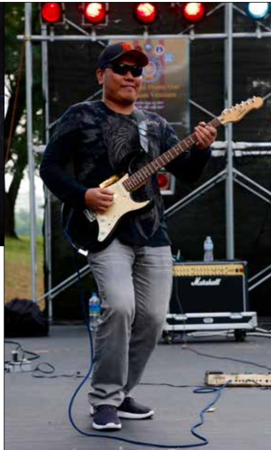
U.S. Army Garrison Yongsan celebrates annual Fall Festival, Sept. 23, at the Williams Avenue and Field #12. Community members gathered to enjoy festivities, including food, live band performances and Korean celebrity entertainment. Fireworks wrapped up this grand event. See more photos at the official USAG Yongsan Facebook.