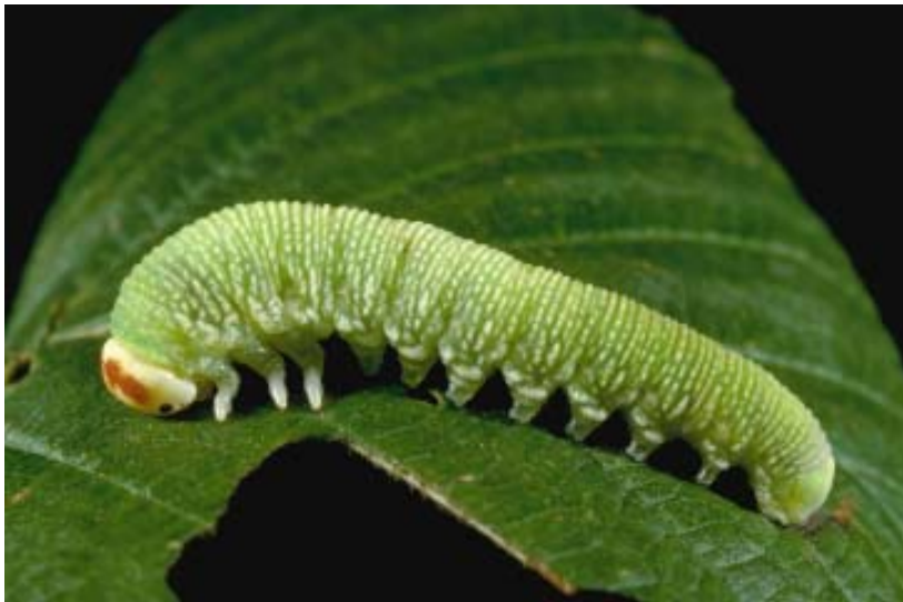
Figure 9 Sawfly larva. Note the eyespots and midabdominal prolegs.

prolegs is one pair per segment on A3-A6 (midabdominal prolegs), and A10 (anal prolegs). Exceptions include the Plusiinae of the Noctuidae, which have prolegs only on A5, A6 and A10, and the Geometridae, which have prolegs on A6 and A10. Some leaf mining caterpillars have reduced prolegs, the remnants of which are merely crochets on the abdominal wall, while other leaf miners may have no prolegs. If prolegs occur on segments A1, A2 or A7-A9, the specimen is most likely a sawfly (Figure 9).