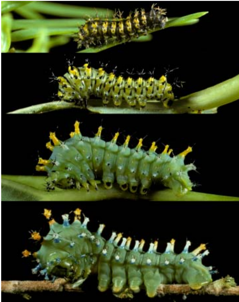
Figure 7 The second through fifth instars of Hyalophora euryalus .