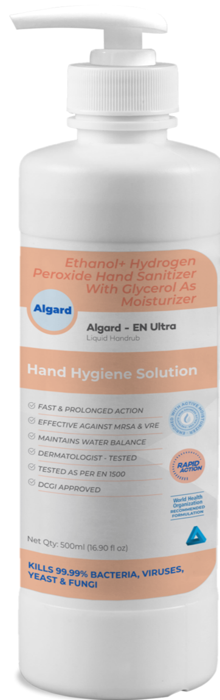
EN Ultra 80% Alcohol Based Hand Sanitizer