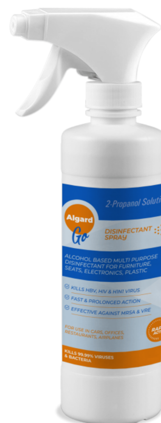
Algard Go Alcohol Based Disinfectant Spray