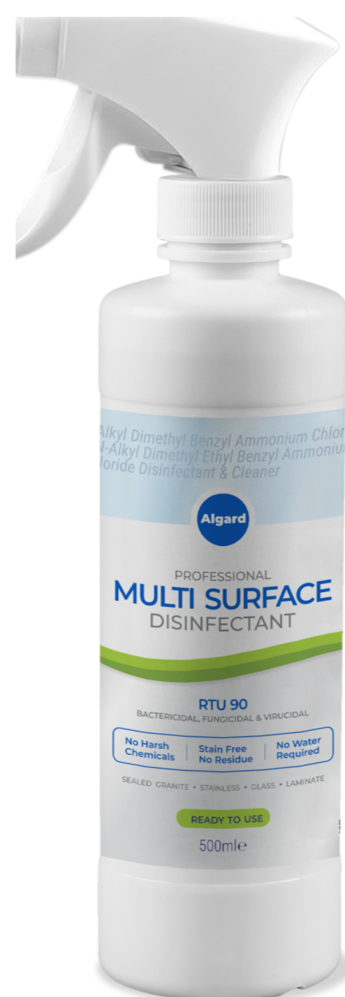
RTU-90 Professional Multi-Surface Disinfectant