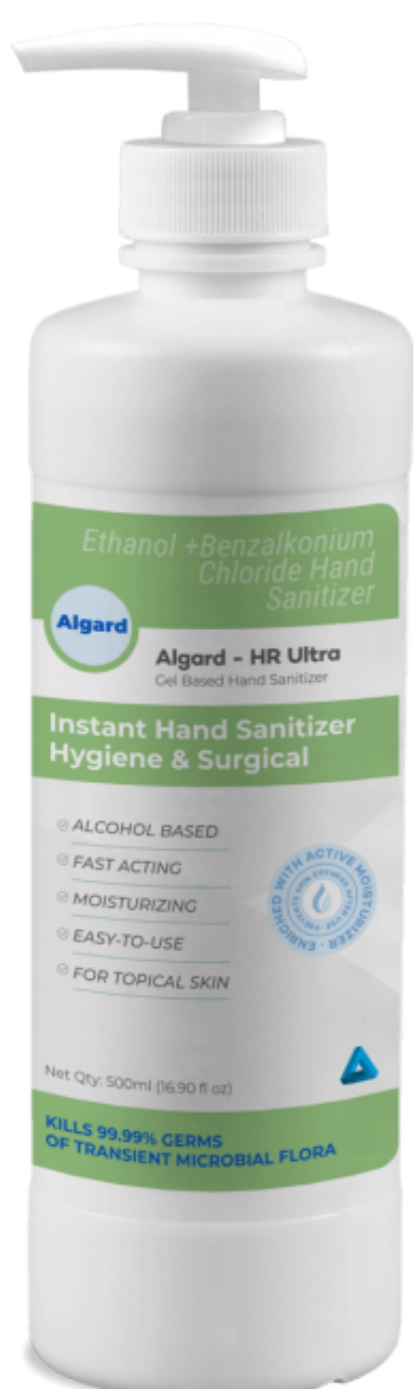
HR Ultra (Liquid) 70% Alcohol Based Hand Sanitizer