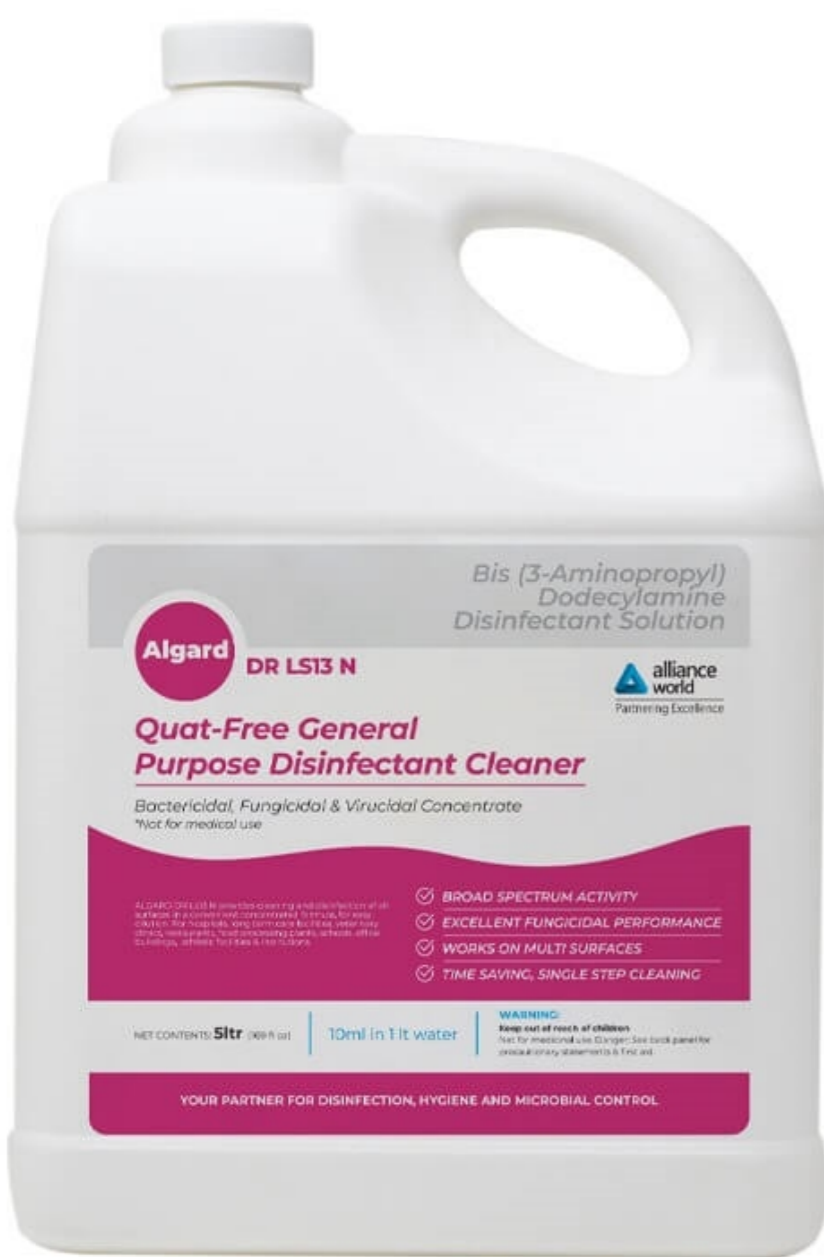
DR LS13 N General Purpose Disinfectant Cleaner (Quat-Free)