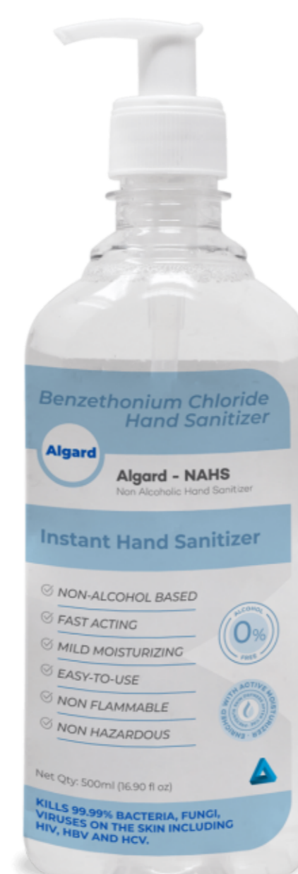
NAHS Non Alcoholic Hand Sanitizer