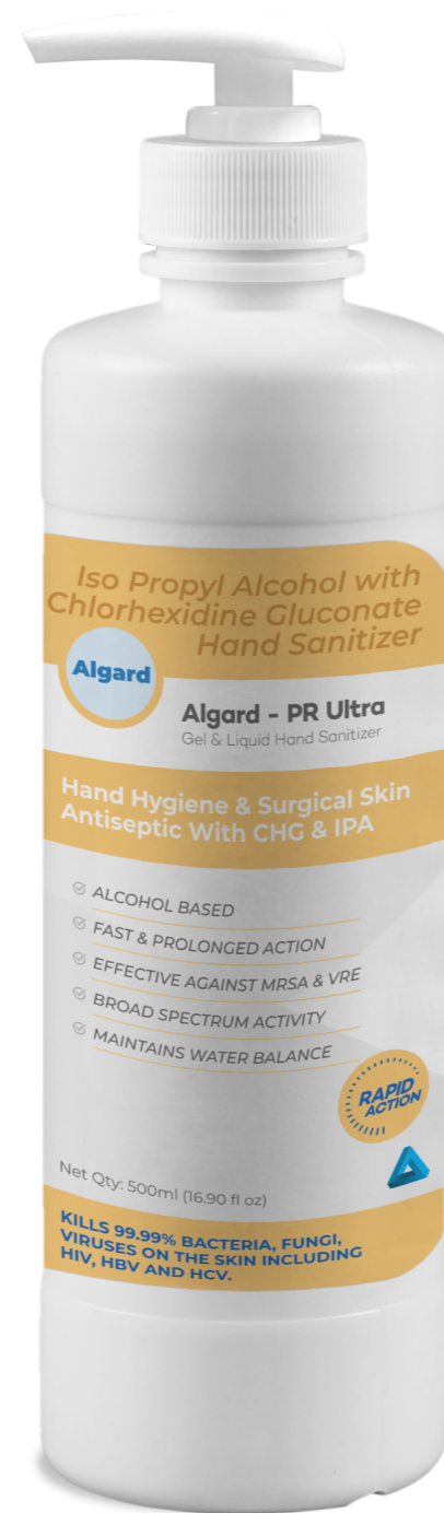
PR Ultra 70% Alcohol Based Hand Sanitizer