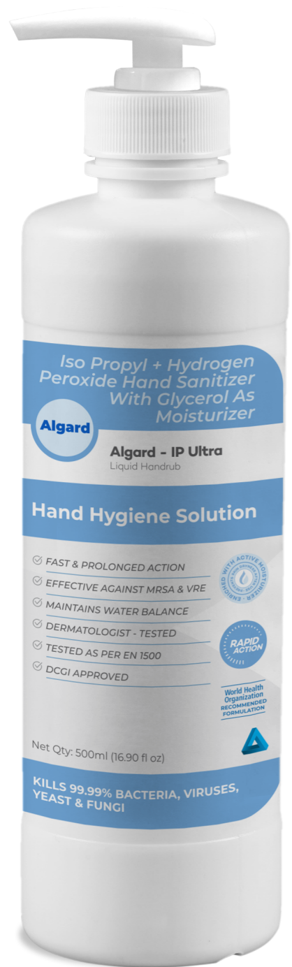
IP Ultra 75% Alcohol Based Hand Sanitizer