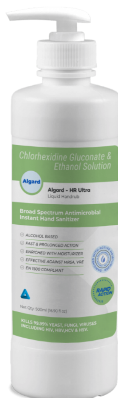
HR Ultra (Gel) 70% Alcohol Based Hand Sanitizer