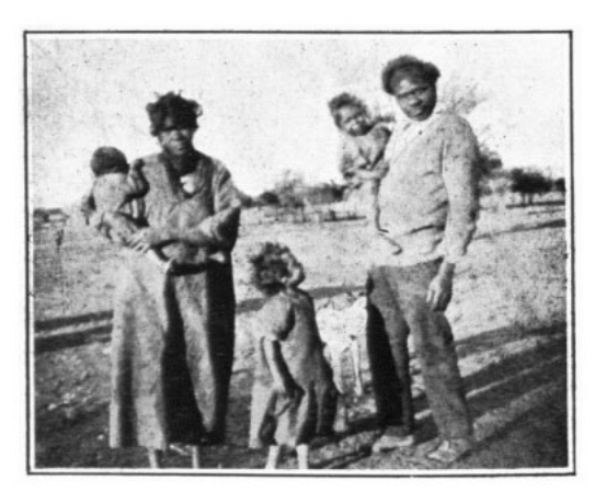
A Native Family.