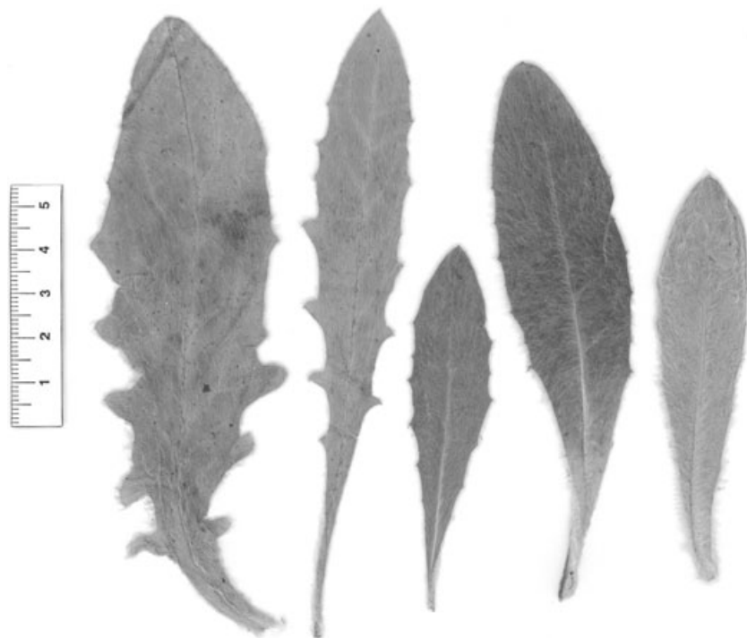
Figure 2. Hieracium petrovae sp. nov. Variation spectrum of cauline leaves.