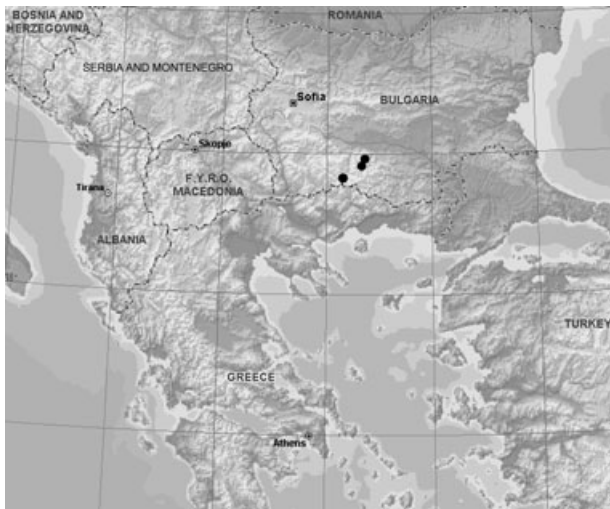
Figure 4. Distribution of Hieracium petrovae sp. nov.

Taxa from H. heldreichii s.l. and H. pilosissimum s.l. differ from H. petrovae in having a less dense indumentum of (sub)plumose hairs on the stem and leaves. Moreover, their inflorescence branches bear 1–3 well-developed capitula, whereas in H. petrovae the monocephalous branches prevail or the second and the third heads are usually aborted.