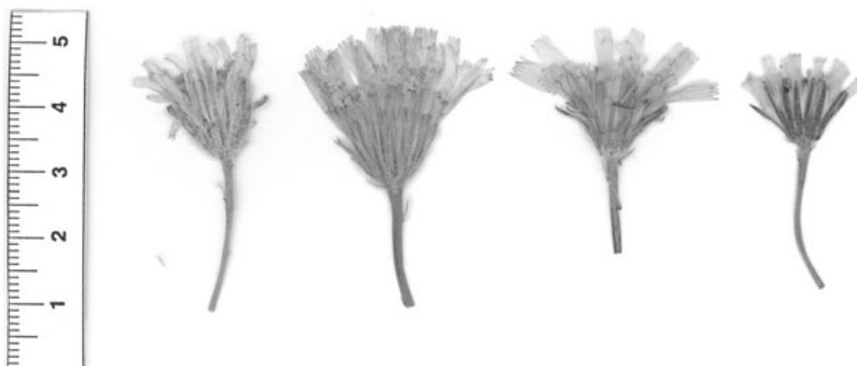
Figure 3. Hieracium petrovae sp. nov. Variation in density of involucre indumentum.

linear-lanceolate, acute, 10–14(15) × 0.9–1.2 mm; the outer dark green with pale margins, covered with dense stellate hairs, sparse to dense, flexuous, subplumose hairs, 1–3.5 mm long, and moderate to dense (in the upper part) microglands, 0.05–0.2 mm long; the inner papillose, covered with dense stellate and microglandular hairs, without or with a few flexuous subplumose hairs. Ligules yellow, glabrous at apex. Stigmas yellow. Achenes 3.8–4.8 × 0.6–0.8 mm, stramineous. Pappus of 6–7 mm long hairs. Margins of