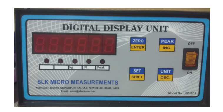
TABLE TOP DIGITAL INDICATOR