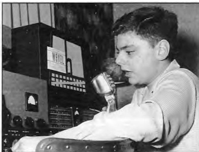
Photo A. The author at the controls of his amateur radio station in Milwaukee, WI, 60 years ago this month.