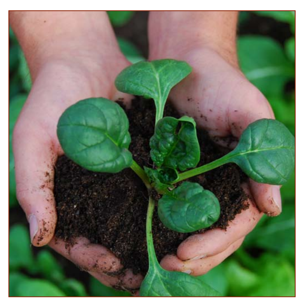
renewing the face of the earth

a publication of the center for action and contemplation