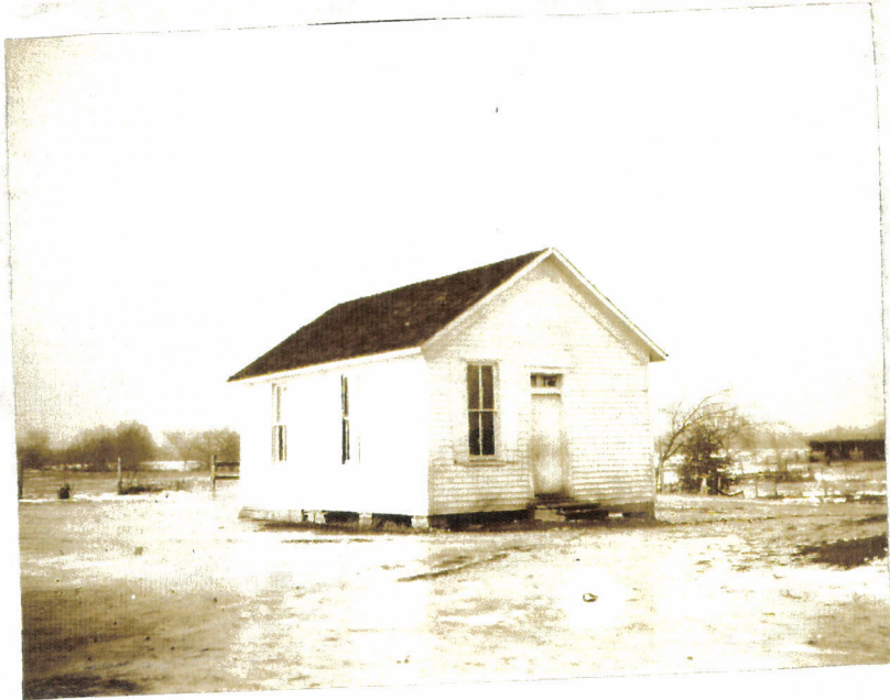
Hopewell No. 118, 8-8. 113