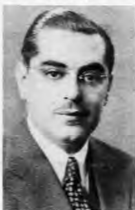
GOV. JOHN O. PASTORE