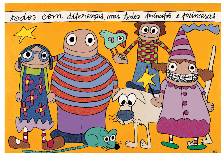
All with differences, but all princes and princesses