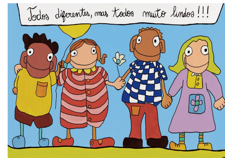
All different, but all very beautiful!!!