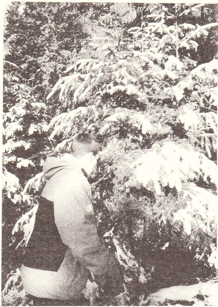
Each year we cut our own Christmas tree from the wooded hillside above the seminary.