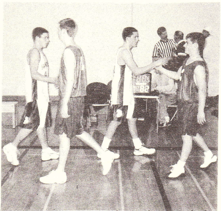
After the game, opposing teams show good sportsmanship by shaking hands.