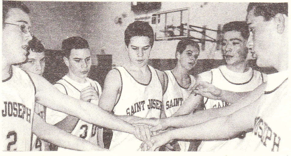
St. Joseph Sentinels put out a cheer before taking to the court in a recent game.