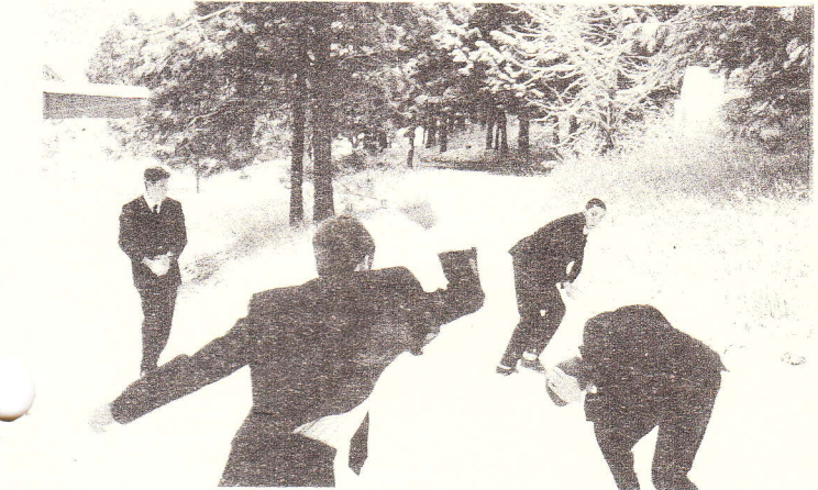
Even seminarians can't resist the urge to have a friendly snowball fight during a break between classes.