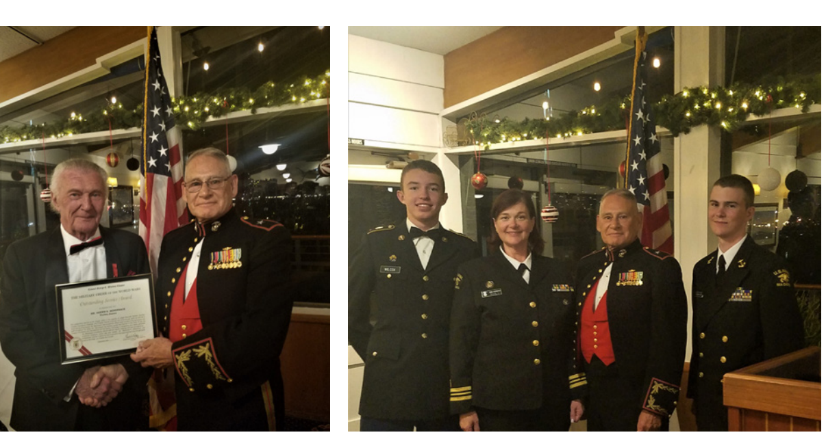
COL Woolsey Chapter, CA