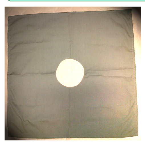
ABOVE YOU SEE A SAMPLE OF OUR MISTY PERCALE FABRIC. HERE WE HAVE USED IT TO MAKE A 24X24 EYE OR CIRC DRAPE.