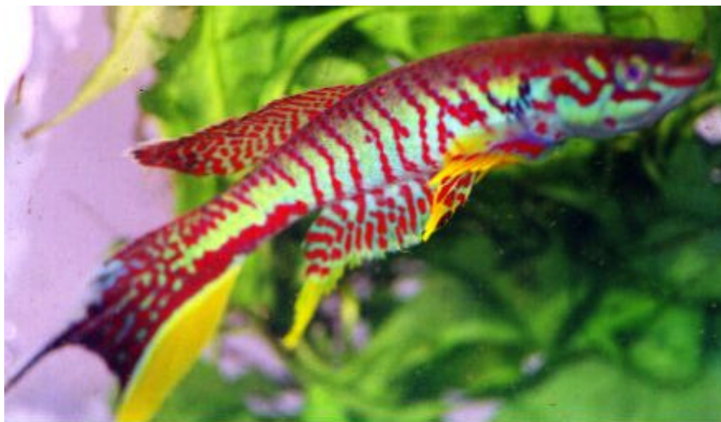
Aphyosemion batesii (kunzi) K99 T.T.