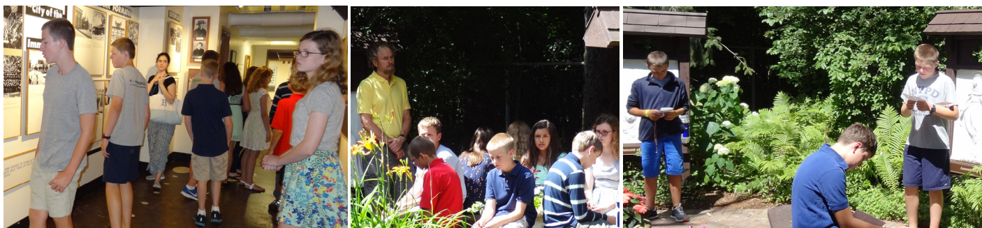
Eighth Grade Fieldtrip to Maytown