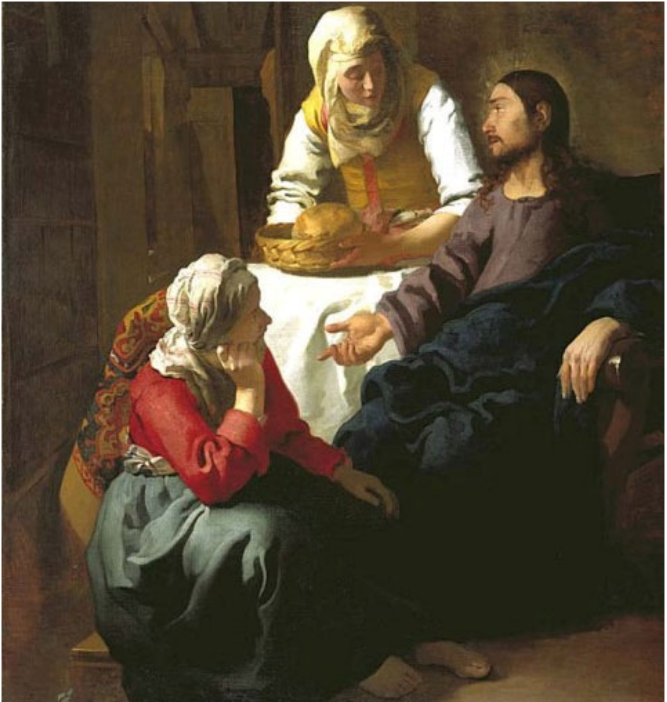
Christ in the House of Martha and Mary Vermeer, 1655