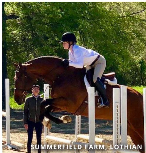
SUMMERFIELD FARM, LOTHIAN