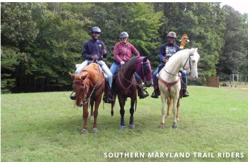
SOUTHERN MARYLAND TRAIL RIDERS