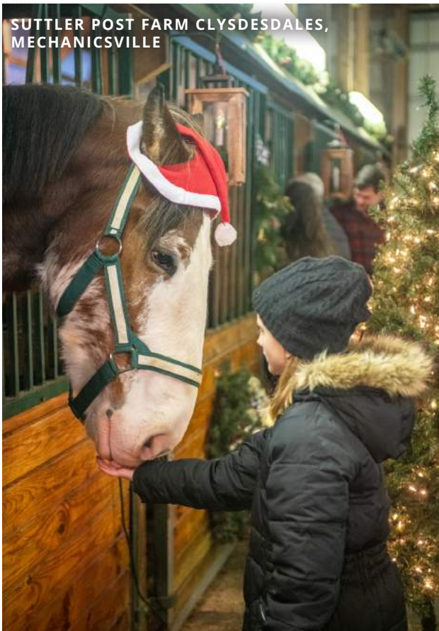
SUTTLE POST FARM CLYDESDALES, MECHANICSVILLE