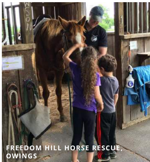
FREEDOM HILL HORSE RESCUE, OWINGS