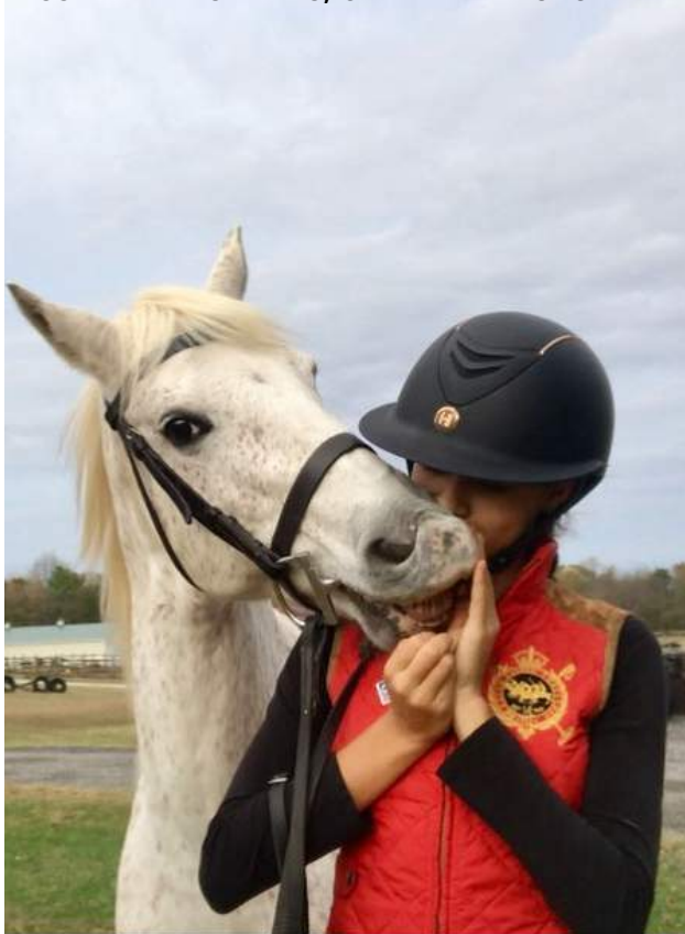
ROSARYVILLE STABLES, UPPER MARLBORO

We ride all year; only 15 minutes from the beltway!