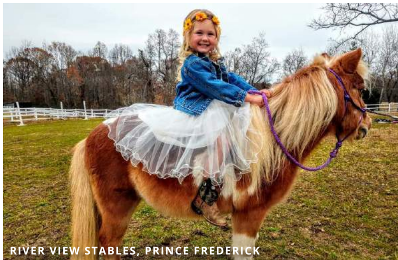
RIVER VIEW STABLES, PRINCE FREDERICK

The Horse Extra lists more than 50 horse barns and facilities that offer riding lessons, horse-boarding, training, sales and breeding. Plus, listings that feature support services for horses and their owners including area hay producers, feed mills and suppliers, tack shops, farriers, vets, horse rescue and care facilities, area riding clubs and noteworthy Maryland equine organizations and associations. Also included is a section on state and county park trails systems that welcome equestrians. In addition to the Horse Extra, you can find more SMADC guides and links to the region's farms and farm services at SMADC.COM .