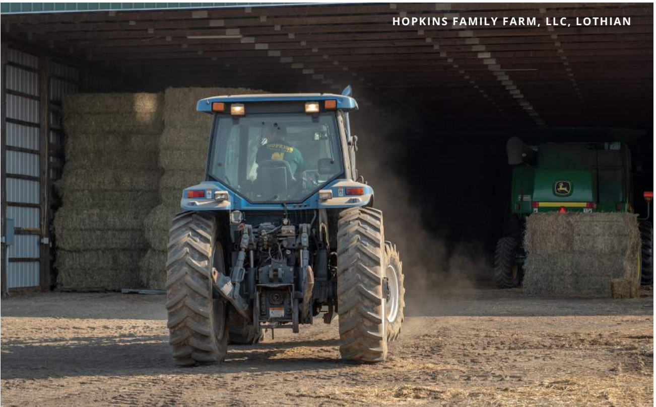
HOPKINS FAMILY FARM, LLC, LOTHIAN