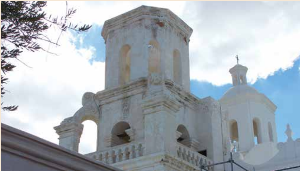
East and north sides of East Tower

exterior, exposing the structure to further damage.