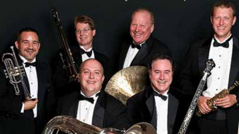
(Left) Members of the Original Wildcat Jass Band