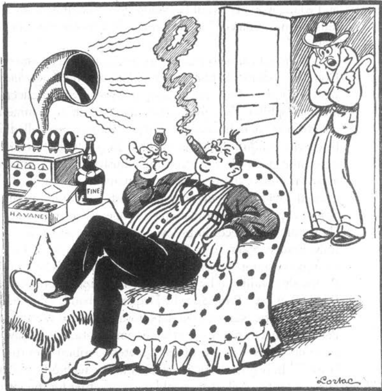
SIGNES AVANT-COUREURS — Quelle merveille, ces précisions météorologiques ! Je suis là tranquille comme Baptiste, et elle m'annoncent un

ABONNEMENTS : 1 an 61, rue Beaumont, 61 -- PARIS (3 e ) ABONNEMENTS : 6 mois et Colonies..... 40 fr. Téléphone : Archives 65-64 ; Chèques postaux 623.36 France et Colonies..... 22 fr. et ..... de ..... 70 fr. Etranger ..... 38 fr.