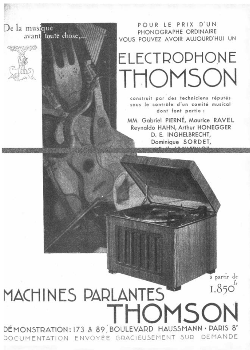
Figure 4. Ad for Thomson record players, at the back of L'Initiation à la musique .