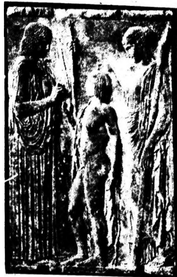
Initiation Into ORPHIC BROTHERHOOD

Minister for the Albertson Memorial Church of Spiritualism, Stamford, Connecticut