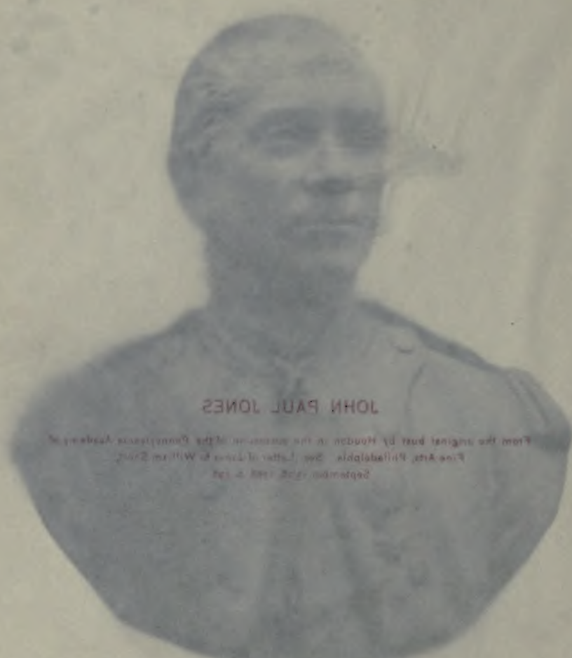
JOHN PAUL JONES