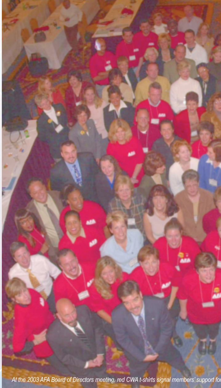
At the 2003 AFA Board of Directors meeting, red CWA t-shirts signal members' support for

When Flight Attendants first organized in 1945, it was as a division of the Air Line Pilots Association