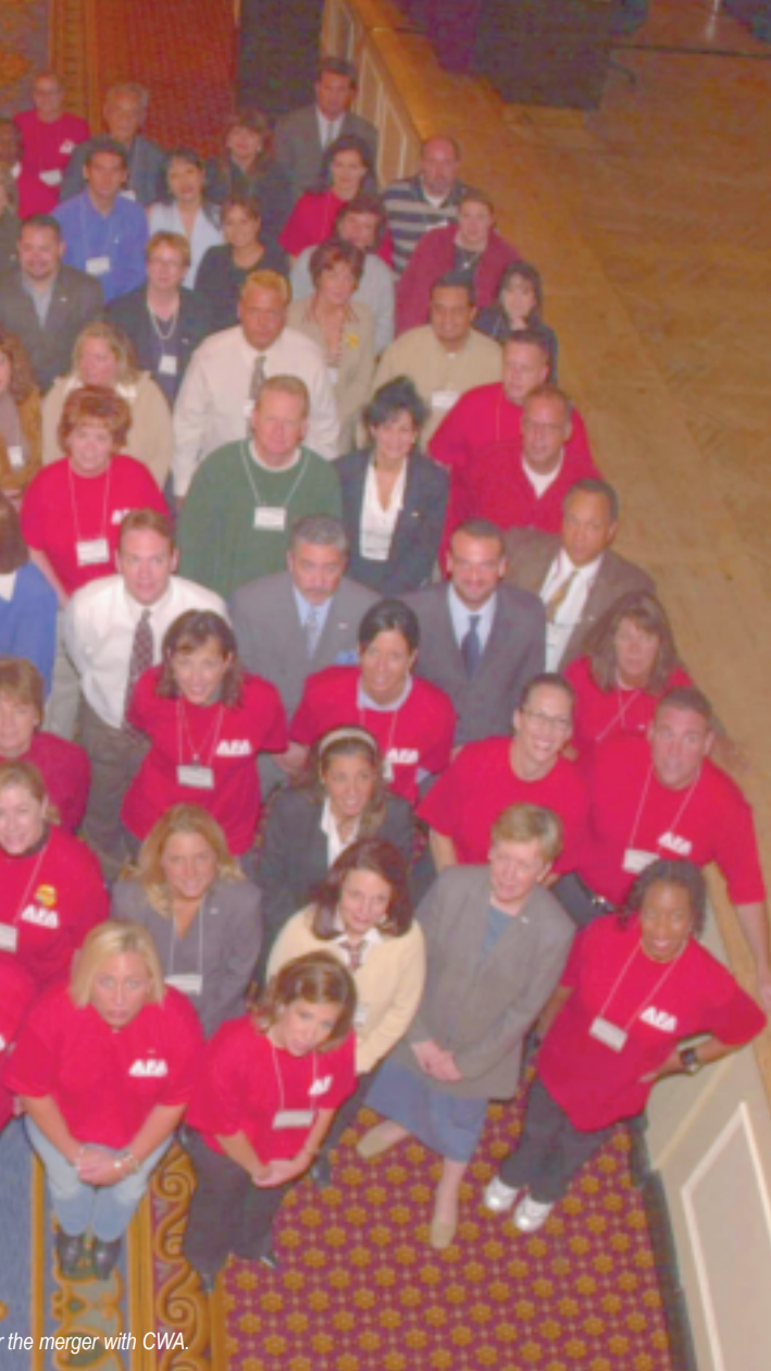
the merger with CWA.

(SIF), AFA was able to launch a nationwide campaign to focus public attention and political scrutiny on management's deceptive tactics and, despite the bankruptcy court's endorsement of management's broken promise, the campaign succeeded in maintaining affordable rates and dramatically reducing cuts to retiree health care.