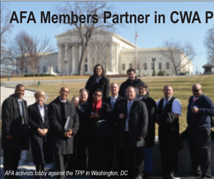
AFA activists lobby against the TPP in Washington, DC

AFA members attended the intensive two-day ACWA Political Legislative Leadership Boot Camp in Houston, February 10-11, 2014, as part of a training series to integrate AFA members as partners in the CWA political movement. The Boot Camp is designed to instill and strengthen the skills of political activists at the local, district and state levels in the framework of building a movement for economic and social justice, expanding our collective vision for a better future for working families. AFA members were joined at the training by U.S. Representatives Gene Green and Sheila Jackson Lee, State Senator John Whitmire and State Representative Sylvester Turner, among other political leaders from Texas.