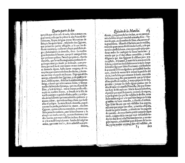
Figure 1: A representative page from microfilm.

that for major "corrections", both cleaned and original images must remain available for inspection by editors and readers.