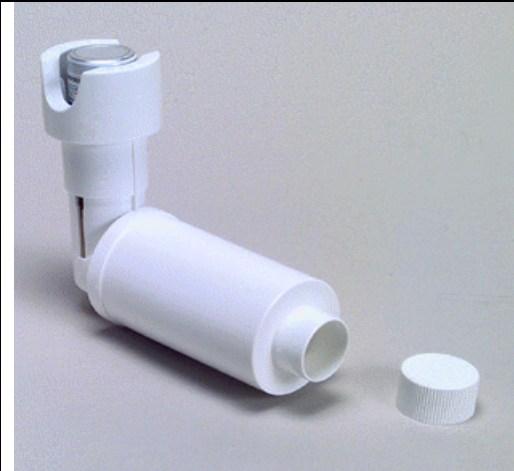
Asmanex Twisthaler (MOMETASONE FUROATE). No generics available.