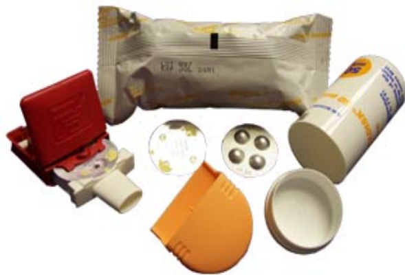
Flovent Discus and packaging