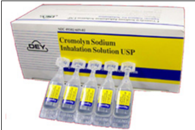
Generic CROMILYN SODIUM Inhalation Solution (Nebulizer)

Tilade (NEDOCROMIL). No generic available.